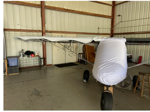
Rans S-12 Canopy/Nose & Wing Covers, test fit