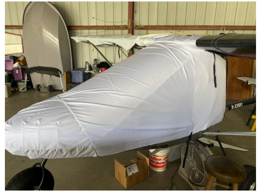
Rans S-12 Canopy/Nose Cover, test fit