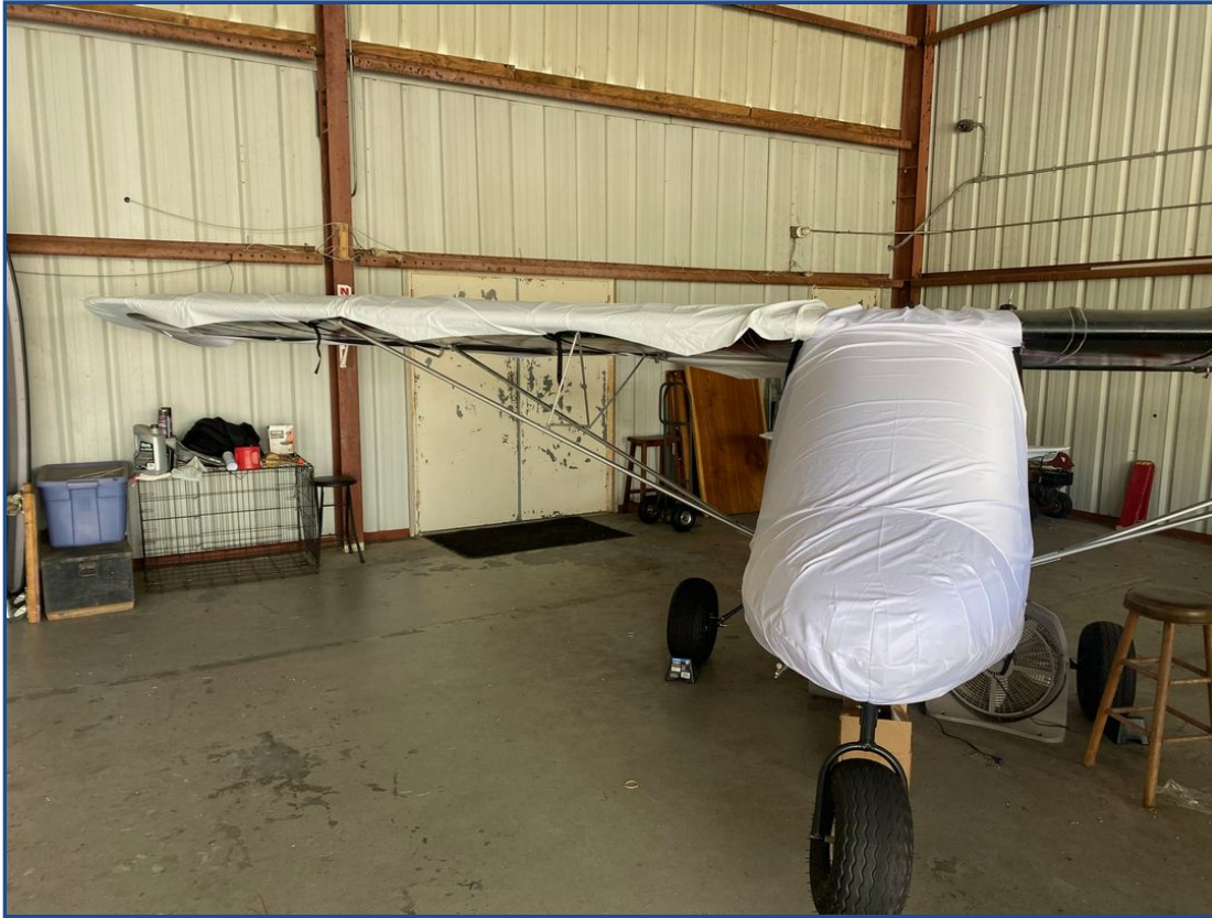
Rans S-12 Canopy/Nose &amp; Wing Covers, test fit