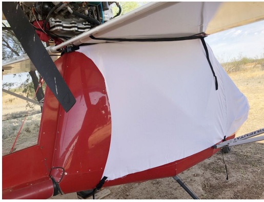
Rans S-12 Airaile Canopy/Nose Cover (test fit cover)