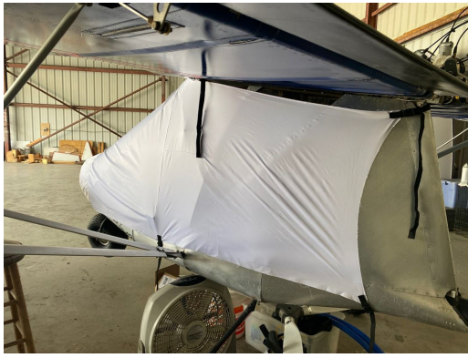
Rans S-12 Canopy/Nose Cover, test fit