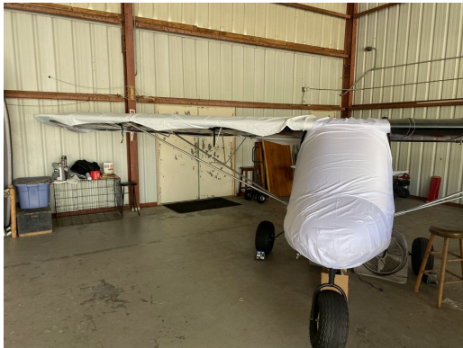
Rans S-12 Canopy/Nose & Wing Covers, test fit

WINTER USE MATERIAL - Made with Solution-Dyed Polyester fabric, this option is intended for seasonal use to aid in deicing, rain mitigation, or for occasional travel. The material is lighter and more compact, but more susceptible to UV damage and may have a shorter useful life if used continuously outside than the all-year use material.