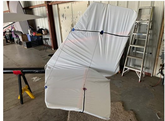
Rans S-12 Empennage Cover, test fit