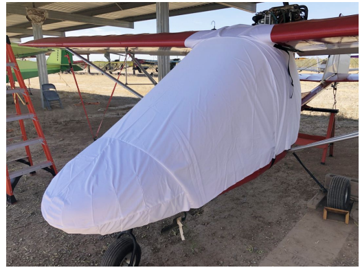
Rans S-12 Airaile Canopy/Nose Cover (test fit cover)