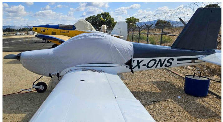
Rans S-19 Canopy/Engine Cover