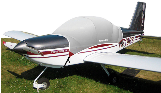
Rans S-19 Canopy Cover (illustration)

This cover type is made from Silver Acrylic Sunbrella canvas and is 100% lined with a soft and smooth microfiber. Bruce's Custom Covers developed this material combination especially for aircraft protection. The outer material is medium weight and treated for water resistance, UV resistance and anti-static buildup. The inner lining is a very soft and smooth microfiber to prevent scratching. The material is very reflective, and tests show that the cabin interior temperature can be reduced to near-ambient temperature on the hottest of days. It is water, ice and snow repellent, yet breathable to allow moisture to escape from between the cover and the aircraft surface.