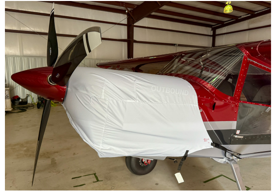
Rans S-21 Engine Cover, test fit cover