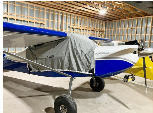
Rans S-21 Travel Weight Canopy Cover