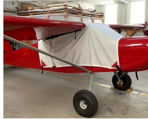
Rans S-21 Over The Top Canopy Cover