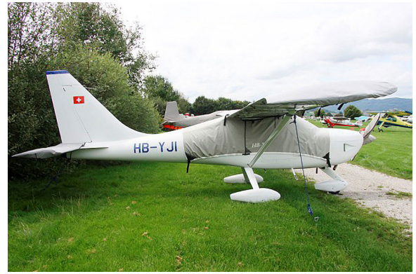
Glastar Canopy, Wings, Horizontal Stab. & Prop Covers