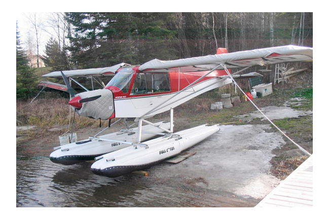
Rans S-7 Insulated Engine, Wing and Horizontal Stabilizer Covers

WINTER USE MATERIAL - Made with Solution-Dyed Polyester fabric, this option is intended for seasonal use to aid in deicing, rain mitigation, or for occasional travel. The material is lighter and more compact, but more susceptible to UV damage and may have a shorter useful life if used continuously outside than the all-year use material.