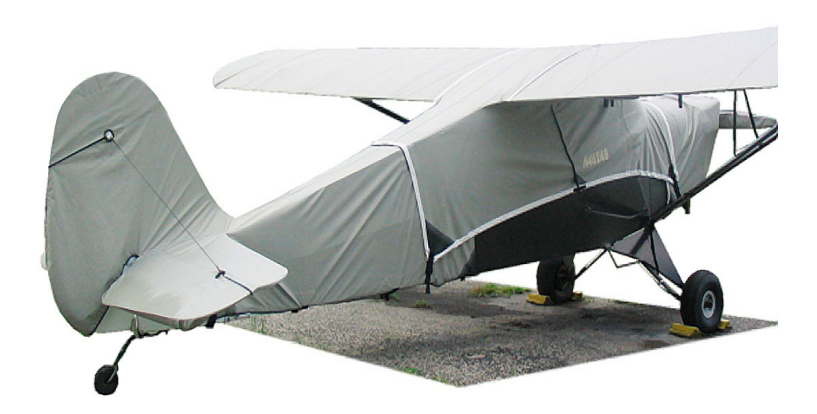
Taylorcraft L-2 Grasshopper Prop, Engine, Canopy, Wing and Empennage Covers