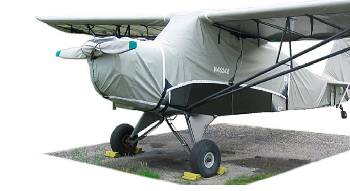
Piper J-3 Extended Canopy Cover