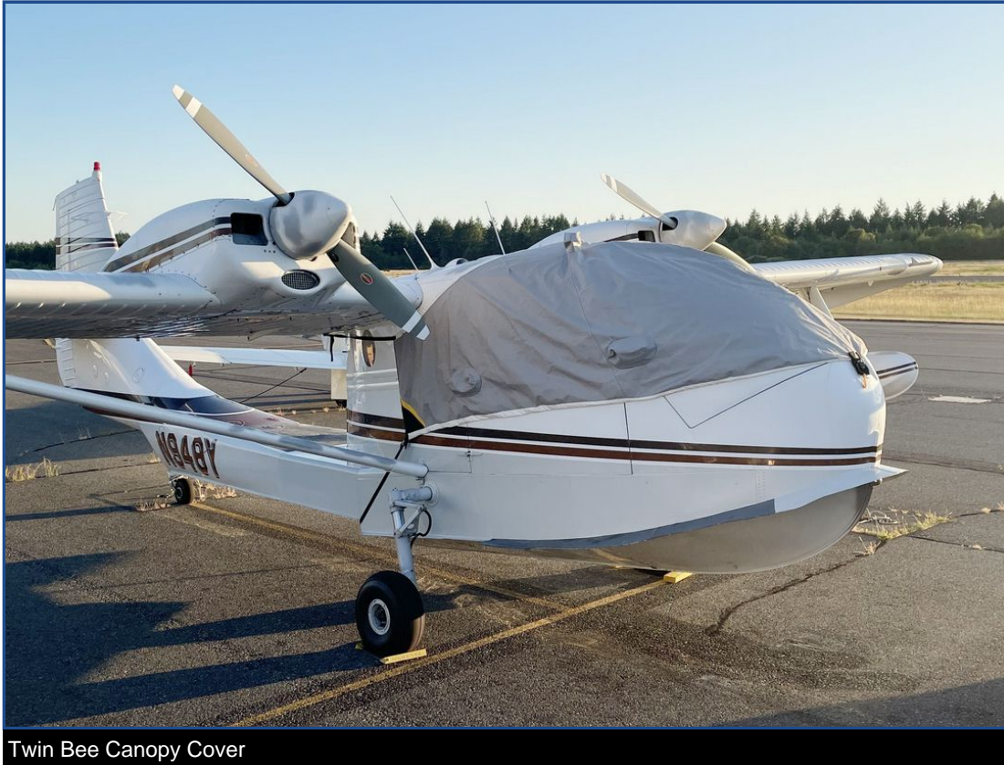
Twin Bee Canopy Cover