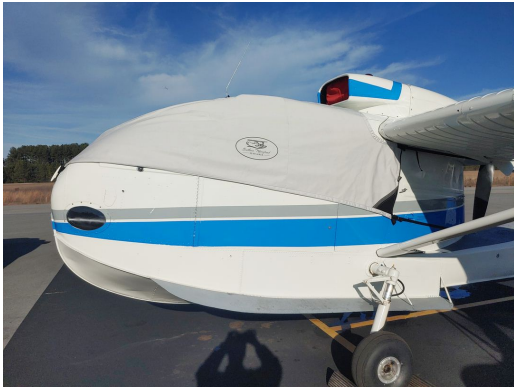
Republic Seabee Canopy Cover

The material is very reflective, and tests show that the cabin interior temperature can be reduced to near-ambient temperature on the hottest of days. It is water, ice and snow repellent, yet breathable to allow moisture to escape from between the cover and the aircraft surface.