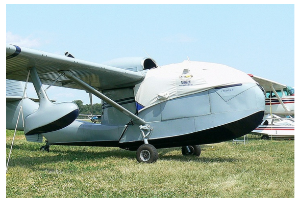
Republic Seabee Canopy Cover