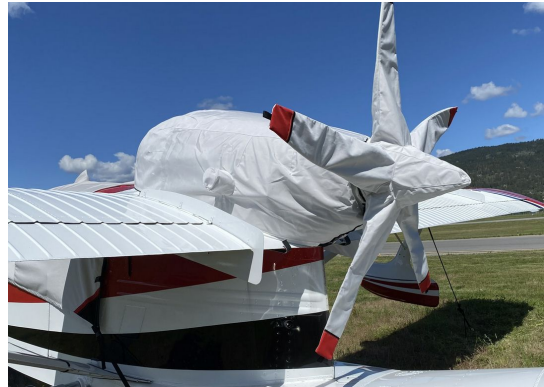
Republic Seabee Canopy, Engine, Prop Cover (5-blade)