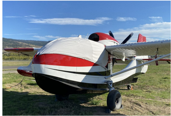
Republic Seabee Canopy Cover