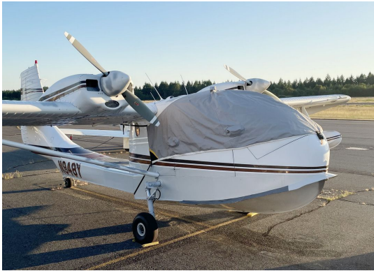
Twin Bee Canopy Cover

The material is very reflective, and tests show that the cabin interior temperature can be reduced to near-ambient temperature on the hottest of days. It is water, ice and snow repellent, yet breathable to allow moisture to escape from between the cover and the aircraft surface.