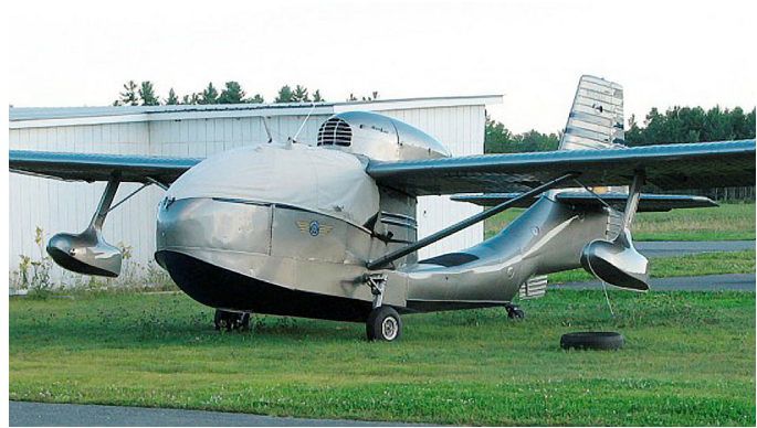
Seabee Canopy Cover