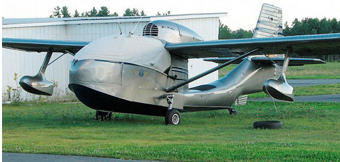
Seabee Canopy Cover

This cover type is made from Silver Acrylic Sunbrella canvas and is 100% lined with a soft and smooth microfiber. Bruce's Custom Covers developed this material combination especially for aircraft protection. The outer material is medium weight and treated for water resistance, UV resistance and anti-static buildup. The inner lining is a very soft and smooth microfiber to prevent scratching. The material is very reflective, and tests show that the cabin interior temperature can be reduced to near-ambient temperature on the hottest of days. It is water, ice and snow repellent, yet breathable to allow moisture to escape from between the cover and the aircraft surface.