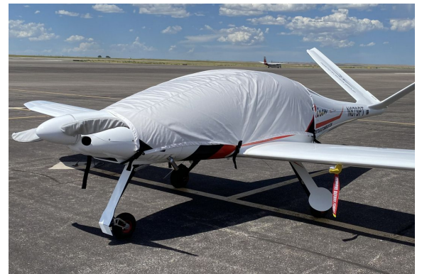
Swiss Excellence Risen 914 Canopy Cover