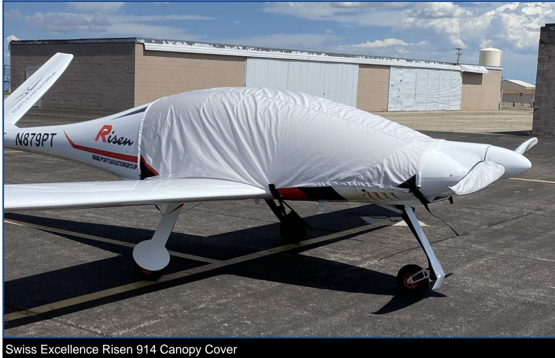
Swiss Excellence Risen 914 Canopy Cover