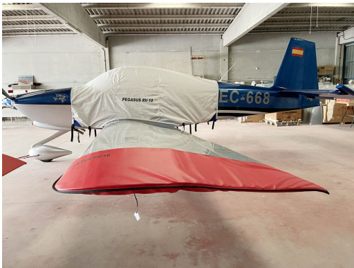
Van's RV-10 Extended Canopy Cover, Wingtip Pads

This cover type is made from Silver Acrylic Sunbrella canvas and is 100% lined with a soft and smooth microfiber. Bruce's Custom Covers developed this material combination especially for aircraft protection. The outer material is medium weight and treated for water resistance, UV resistance and anti-static buildup. The inner lining is a very soft and smooth microfiber to prevent scratching. The material is very reflective, and tests show that the cabin interior temperature can be reduced to near-ambient temperature on the hottest of days. It is water, ice and snow repellent, yet breathable to allow moisture to escape from between the cover and the aircraft surface.