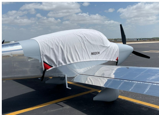
RV-10 Canopy Cover

This cover type is made from Silver Acrylic Sunbrella canvas and is 100% lined with a soft and smooth microfiber. Bruce's Custom Covers developed this material combination especially for aircraft protection. The outer material is medium weight and treated for water resistance, UV resistance and anti-static buildup. The inner lining is a very soft and smooth microfiber to prevent scratching. The material is very reflective, and tests show that the cabin interior temperature can be reduced to near-ambient temperature on the hottest of days. It is water, ice and snow repellent, yet breathable to allow moisture to escape from between the cover and the aircraft surface.