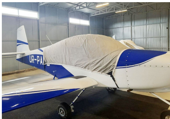
Van's RV-10 Travel Weight Canopy Cover

Travel Covers are made with Silver Solution-Dyed Polyester fabric and only lined over the windshield to save weight. The material is lightweight and more compact for easy stowage in the aircraft. The polyester material is water resistant, but only intended for occasional use outside. We also have an ultra lightweight material available for fitted hangar dust covers. For daily outdoor use, the non-travel Sunbrella Cover is the best choice.