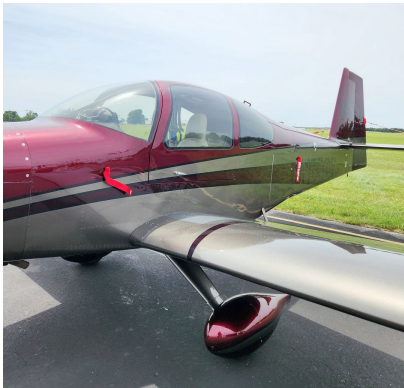
RV-10 Air Vent Wedge Plugs

Engine Inlet Plugs are custom fit for your Van's Aircraft RV-10 intakes, made with heavy-duty vinyl material, and stuffed with a single block of sculpted urethane foam. Each plug has a zipper that allows the foam to be removed and dried if necessary. Engine plugs have warning flags that are visible from the cockpit or 'remove before flight' streamers sewn onto the face of the plugs. Most plugs are imprinted with the aircraft registration number in black for an extra charge. Storage bag NOT included. Engine plugs may be inserted after flight when the engine is still warm. Engine Inlet Plugs are commonly referred to as Cowl Plugs, Intake Plugs, Cowl Blocks, Engine Blocks, and Engine Bungs.