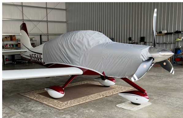
Van's RV-10 Travel Cover