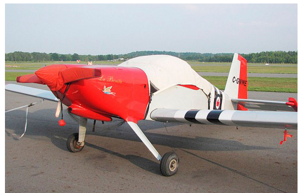
Van's RV-6 2-Blade Prop Cover