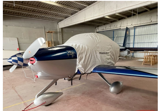
Van's RV-10 Extended Canopy Cover, Engine Plugs