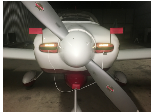
Van's Aircraft RV-7A Engine Inlet Plugs