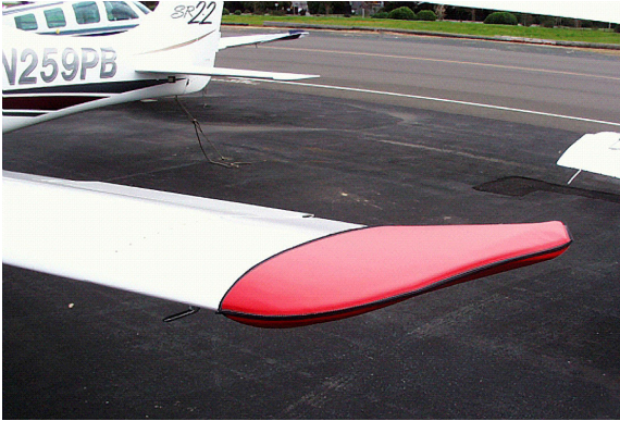
Cirrus SR-22 Wingtip Pad (also available for the Horiz. Stab.)

Designed to prevent damage to the aircraft extremities in crowded hangars, these products are made of bright red Naugahyde and thickly padded with a sandwich of closed cell foam.