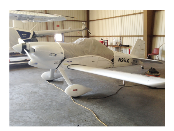
Van's RV-3 Light Weight Travel Cover