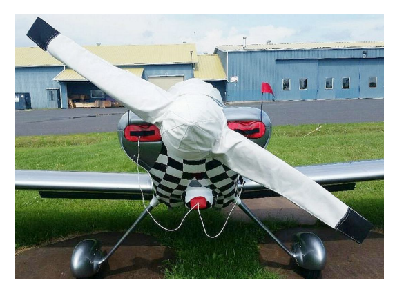
Van's RV-3 Engine Plugs, Prop/Spinner Cover