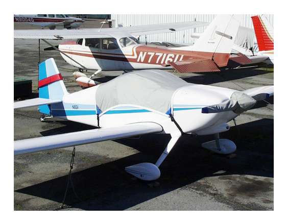
Vans's RV-6 Canopy Cover, Prop Cover

This cover type is made from Silver Acrylic Sunbrella canvas and is 100% lined with a soft and smooth microfiber. Bruce's Custom Covers developed this material combination especially for aircraft protection. The outer material is medium weight and treated for water resistance, UV resistance and anti-static buildup. The inner lining is a very soft and smooth microfiber to prevent scratching. The material is very reflective, and tests show that the cabin interior temperature can be reduced to near-ambient temperature on the hottest of days. It is water, ice and snow repellent, yet breathable to allow moisture to escape from between the cover and the aircraft surface.