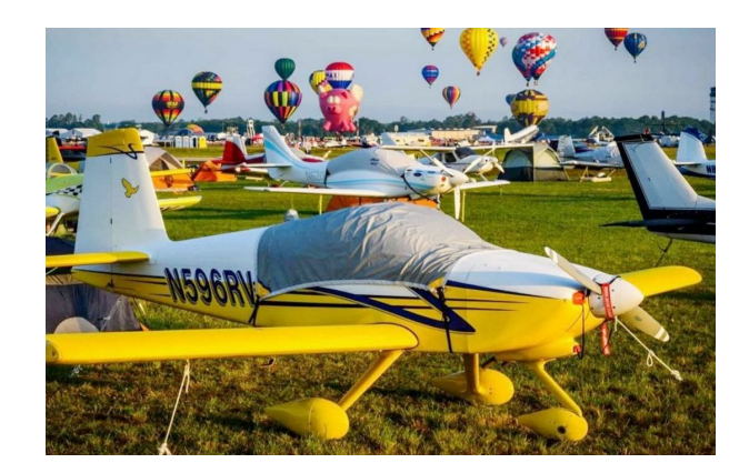
Vans's RV-9 Travel Weight Canopy Cover at Sun 'n Fun

Travel Covers are made with Silver Solution-Dyed Polyester fabric and only lined over the windshield to save weight. The material is lightweight and more compact for easy stowage in the aircraft. The polyester material is water resistant, but only intended for occasional use outside. We also have an ultra lightweight material available for fitted hangar dust covers. For daily outdoor use, the non-travel Sunbrella Cover is the best choice.