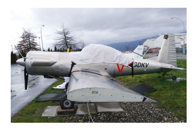
Van's RV-3 (modified) Canopy Cover

This cover type is made from Silver Acrylic Sunbrella canvas and is 100% lined with a soft and smooth microfiber. Bruce's Custom Covers developed this material combination especially for aircraft protection. The outer material is medium weight and treated for water resistance, UV resistance and anti-static buildup. The inner lining is a very soft and smooth microfiber to prevent scratching. The material is very reflective, and tests show that the cabin interior temperature can be reduced to near-ambient temperature on the hottest of days. It is water, ice and snow repellent, yet breathable to allow moisture to escape from between the cover and the aircraft surface.