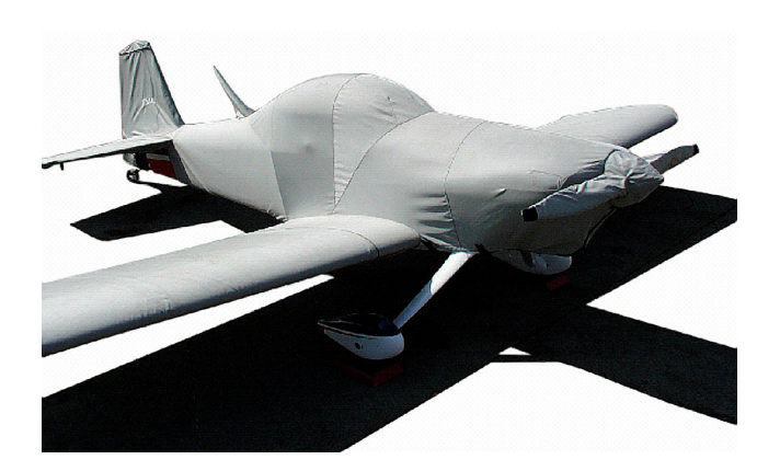
Van's RV-4 Complete Cover