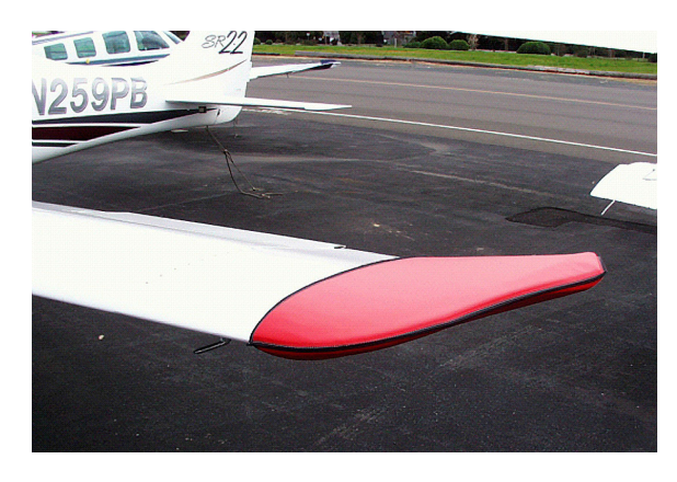
Cirrus SR-22 Wingtip Pad (also available for the Horiz. Stab.