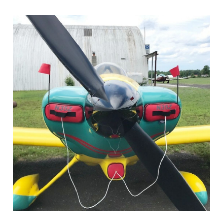
Van's Aircraft RV-4 Engine Inlet Plugs