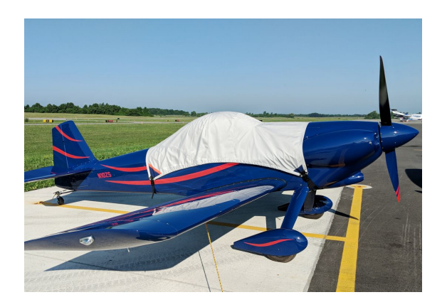
Van's RV-3 Canopy Cover