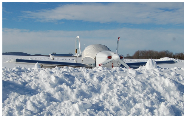
Van's RV-6 Canopy Cover