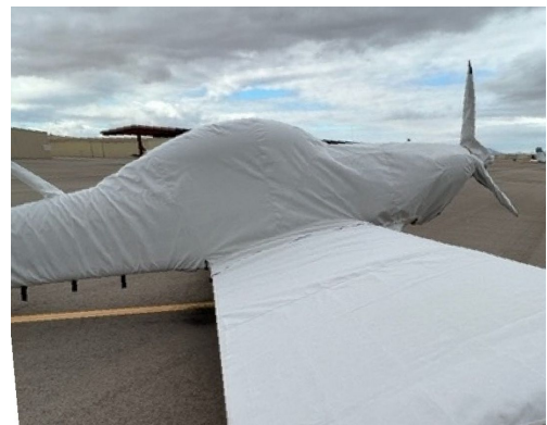
Vans RV-8 Complete Cover Set