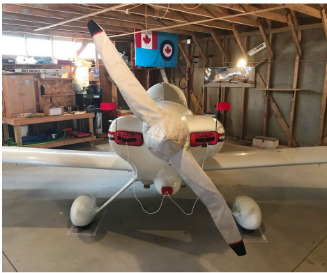
Van's RV-4 Prop Cover, Engine Inlet Plugs

Engine Inlet Plugs are custom fit for your Van's Aircraft RV-4 intakes, made with heavy-duty vinyl material, and stuffed with a single block of sculpted urethane foam. Each plug has a zipper that allows the foam to be removed and dried if necessary. Engine plugs have warning flags that are visible from the cockpit or 'remove before flight' streamers sewn onto the face of the plugs. Most plugs are imprinted with the aircraft registration number in black for an extra charge. Storage bag NOT included. Engine plugs may be inserted after flight when the engine is still warm. Engine Inlet Plugs are commonly referred to as Cowl Plugs, Intake Plugs, Cowl Blocks, Engine Blocks, and Engine Bungs.