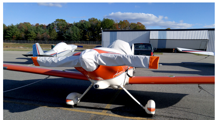
Van's Aircraft RV-4 Propeller/Spinner Cover, 2 Blade