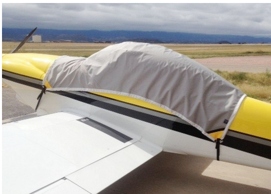
Van's Aircraft RV-4 Travel Cover, Light Weight Travel Canopy Cover, W/15" Fwd Extension, Belly Strap Type

Travel Covers are made with Silver Solution-Dyed Polyester fabric and only lined over the windshield to save weight. The material is lightweight and more compact for easy stowage in the aircraft. The polyester material is water resistant, but only intended for occasional use outside. We also have an ultra lightweight material available for fitted hangar dust covers. For daily outdoor use, the non-travel Sunbrella Cover is the best choice.