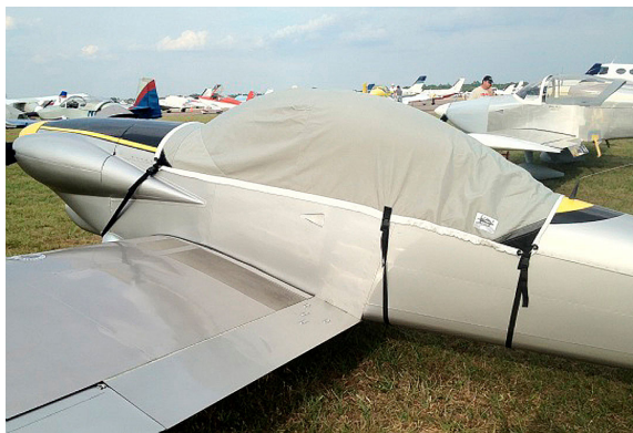
Van's RV-4 Canopy Cover

This cover type is made from Silver Acrylic Sunbrella canvas and is 100% lined with a soft and smooth microfiber. Bruce's Custom Covers developed this material combination especially for aircraft protection. The outer material is medium weight and treated for water resistance, UV resistance and anti-static buildup. The inner lining is a very soft and smooth microfiber to prevent scratching. The material is very reflective, and tests show that the cabin interior temperature can be reduced to near-ambient temperature on the hottest of days. It is water, ice and snow repellent, yet breathable to allow moisture to escape from between the cover and the aircraft surface.