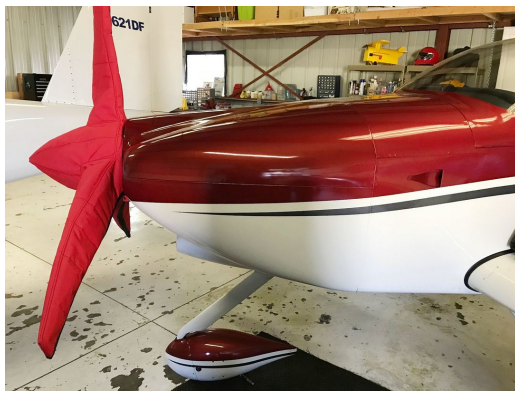
Van's RV-9 Insulated Prop Cover, 3-blade