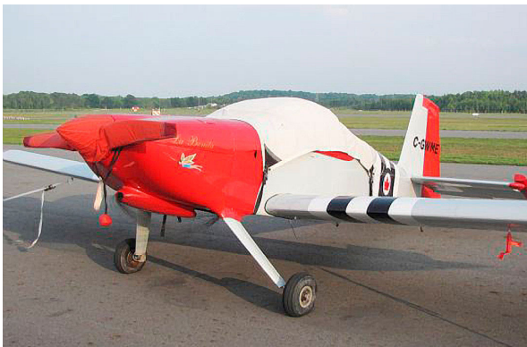
Van's RV-9 Canopy & Prop Covers

This cover type is made from Silver Acrylic Sunbrella canvas and is 100% lined with a soft and smooth microfiber. Bruce's Custom Covers developed this material combination especially for aircraft protection. The outer material is medium weight and treated for water resistance, UV resistance and anti-static buildup. The inner lining is a very soft and smooth microfiber to prevent scratching. The material is very reflective, and tests show that the cabin interior temperature can be reduced to near-ambient temperature on the hottest of days. It is water, ice and snow repellent, yet breathable to allow moisture to escape from between the cover and the aircraft surface.