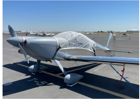
RV-7 Travel Cover, Travel Weight Canopy Cover