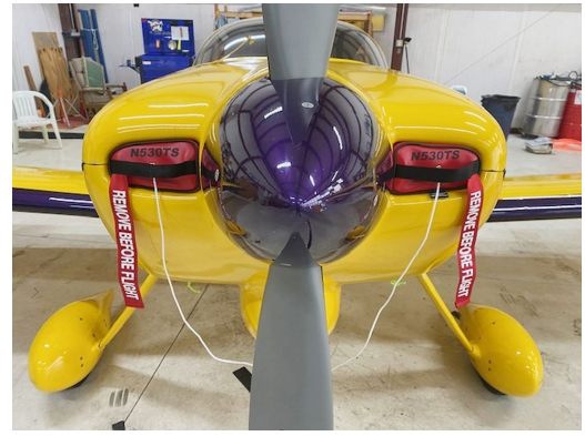
Van's Aircraft RV-7 Engine Inlet Plugs