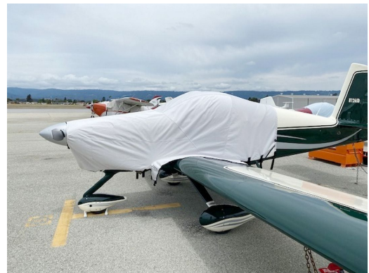
Van's RV-9A Extended Canopy/Engine Cover