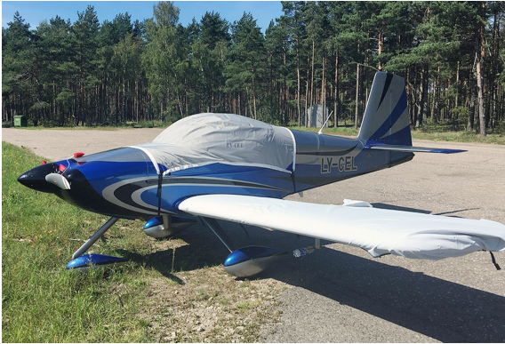
Van's RV-7/7A Travel and Wing Covers

Travel Covers are made with Silver Solution-Dyed Polyester fabric and only lined over the windshield to save weight. The material is lightweight and more compact for easy stowage in the aircraft. The polyester material is water resistant, but only intended for occasional use outside. We also have an ultra lightweight material available for fitted hangar dust covers. For daily outdoor use, the non-travel Sunbrella Cover is the best choice.