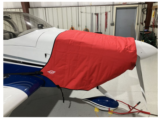
Van's Aircraft RV-7A Insulated Engine Cover