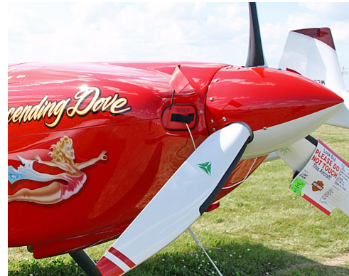
Van's RV-8 Engine Inlet Plugs