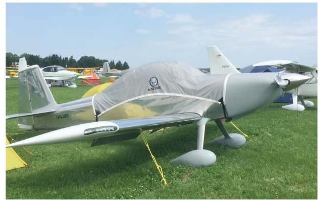
Vans's RV-9 Travel Weight Canopy Cover at Sun 'n Fun Van's Aircraft RV-8 Travel Cover, Light Weight Travel Canopy Cover