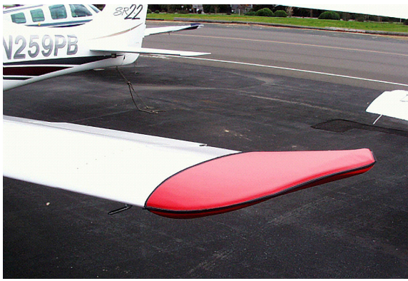
Cirrus SR-22 Wingtip Pad (also available for the Horiz. Stab.)