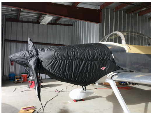
Van's RV-8 Insulated Prop and Engine Covers (sold separately)

This cover type is made from Silver Acrylic Sunbrella canvas and is 100% lined with a soft and smooth microfiber. Bruce's Custom Covers developed this material combination especially for aircraft protection. The outer material is medium weight and treated for water resistance, UV resistance and anti-static buildup. The inner lining is a very soft and smooth microfiber to prevent scratching. The material is very reflective, and tests show that the cabin interior temperature can be reduced to near-ambient temperature on the hottest of days. It is water, ice and snow repellent, yet breathable to allow moisture to escape from between the cover and the aircraft surface.