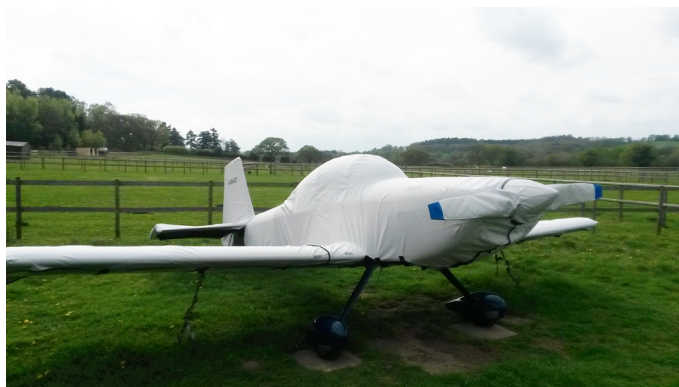
Van's RV-8 Complete Fuselage Cover w/ Detachable Wing Covers & Prop Cover