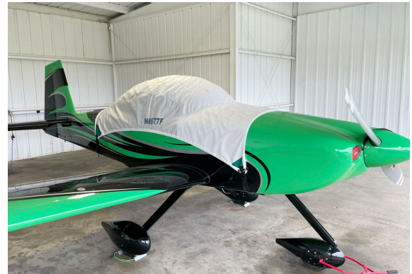
RV-8A Canopy Cover, Extends to Cover Baggage Door