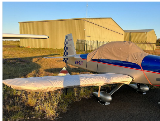
Van's Aircraft RV-8/8A Wing Covers, All Year Use

WINTER USE MATERIAL - Made with Solution-Dyed Polyester fabric, this option is intended for seasonal use to aid in deicing, rain mitigation, or for occasional travel. The material is lighter and more compact, but more susceptible to UV damage and may have a shorter useful life if used continuously outside than the all-year use material.