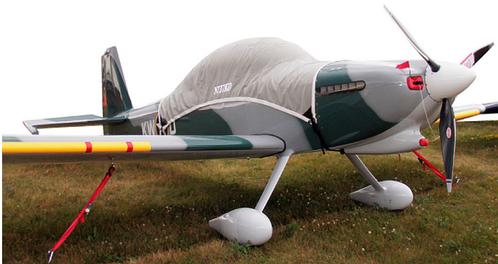
Van's RV-8 Canopy Cover & Engine Inlet Plugs

This cover type is made from Silver Acrylic Sunbrella canvas and is 100% lined with a soft and smooth microfiber. Bruce's Custom Covers developed this material combination especially for aircraft protection. The outer material is medium weight and treated for water resistance, UV resistance and anti-static buildup. The inner lining is a very soft and smooth microfiber to prevent scratching. The material is very reflective, and tests show that the cabin interior temperature can be reduced to near-ambient temperature on the hottest of days. It is water, ice and snow repellent, yet breathable to allow moisture to escape from between the cover and the aircraft surface.