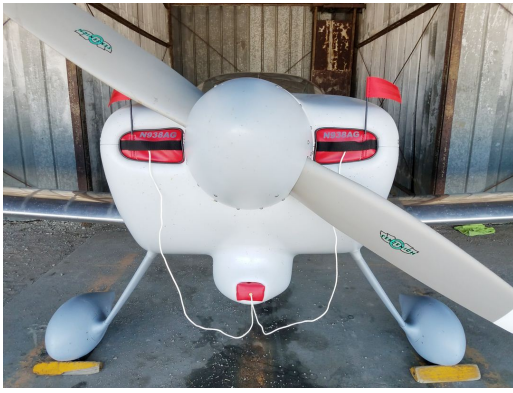
Van's RV-9 Engine Inlet Plugs