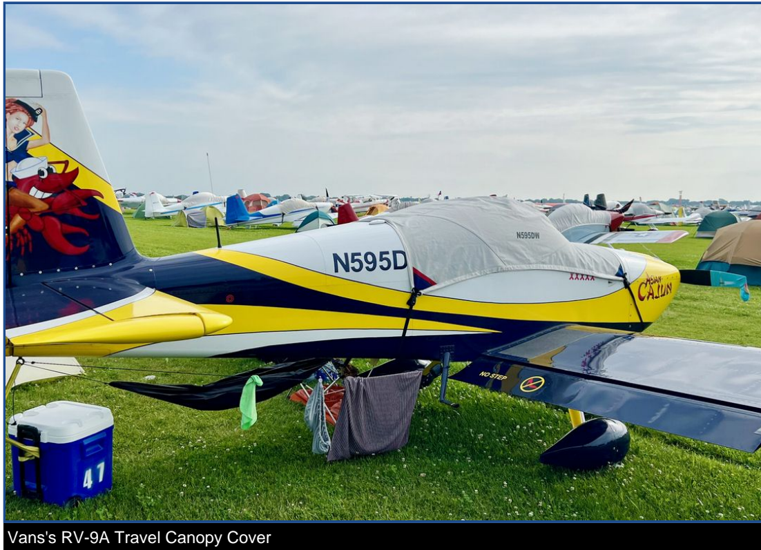
Vans's RV-9A Travel Canopy Cover