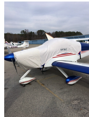
Van's RV-9 Canopy Engine Cover