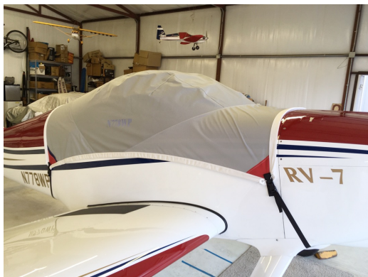
Van's RV-7 Travel Canopy Cover

lightweight and more compact for easy stowage in the aircraft. The polyester material is water resistant, but only intended for occasional use outside. We also have an ultra lightweight material available for fitted hangar dust covers. For daily outdoor use, the non-travel Sunbrella Cover is the best choice.