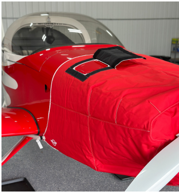
Van's RV-9A Insulated Engine Cover with oil door access