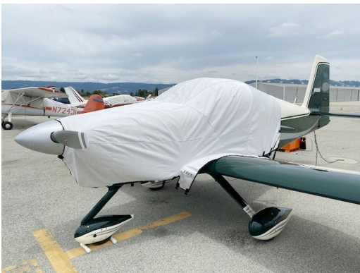
Van's RV-9A Extended Canopy/Engine Cover

This cover type is made from Silver Acrylic Sunbrella canvas and is 100% lined with a soft and smooth microfiber. Bruce's Custom Covers developed this material combination especially for aircraft protection. The outer material is medium weight and treated for water resistance, UV resistance and anti-static buildup. The inner lining is a very soft and smooth microfiber to prevent scratching. The material is very reflective, and tests show that the cabin interior temperature can be reduced to near-ambient temperature on the hottest of days. It is water, ice and snow repellent, yet breathable to allow moisture to escape from between the cover and the aircraft surface.