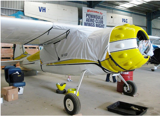
Cessna 195 Canopy Cover, over-top, 24" fwd ext to cover cowl ring gap, gas cap ext.

The material is very reflective, and tests show that the cabin interior temperature can be reduced to near-ambient temperature on the hottest of days. It is water, ice and snow repellent, yet breathable to allow moisture to escape from between the cover and the aircraft surface.