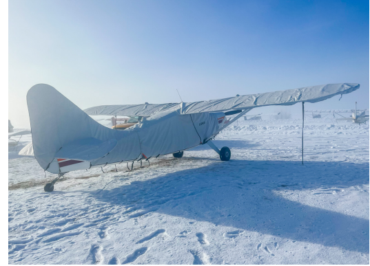
Stinson 108 Winter Cover Set