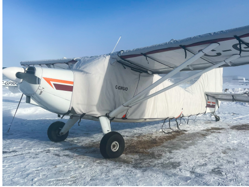
Stinson 108 Winter Cover Set

WINTER USE MATERIAL - Made with Solution-Dyed Polyester fabric, this option is intended for seasonal use to aid in deicing, rain mitigation, or for occasional travel. The material is lighter and more compact, but more susceptible to UV damage and may have a shorter useful life if used continuously outside than the all-year use material.