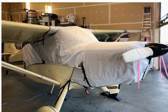
Stinson 108 Over-Top Canopy Cover, Engine Cover

This cover type is made from Silver Acrylic Sunbrella canvas and is 100% lined with a soft and smooth microfiber. Bruce's Custom Covers developed this material combination especially for aircraft protection. The outer material is medium weight and treated for water resistance, UV resistance and anti-static buildup. The inner lining is a very soft and smooth microfiber to prevent scratching. The material is very reflective, and tests show that the cabin interior temperature can be reduced to near-ambient temperature on the hottest of days. It is water, ice and snow repellent, yet breathable to allow moisture to escape from between the cover and the aircraft surface.