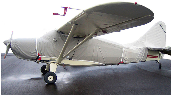
Stinson 108 Canopy, Engine, Prop & Empennage Covers