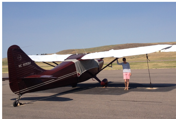
Stinson 108 Canopy Cover & Wing Covers

This cover type is made from Silver Acrylic Sunbrella canvas and is 100% lined with a soft and smooth microfiber. Bruce's Custom Covers developed this material combination especially for aircraft protection. The outer material is medium weight and treated for water resistance, UV resistance and anti-static buildup. The inner lining is a very soft and smooth microfiber to prevent scratching. The material is very reflective, and tests show that the cabin interior temperature can be reduced to near-ambient temperature on the hottest of days. It is water, ice and snow repellent, yet breathable to allow moisture to escape from between the cover and the aircraft surface.