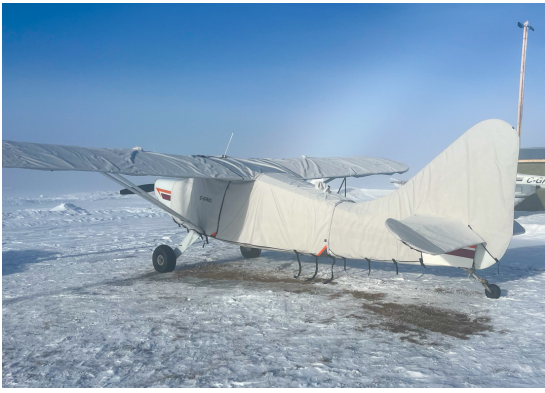
Stinson 108 Winter Cover Set