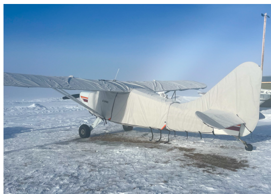
Stinson 108 Winter Cover Set