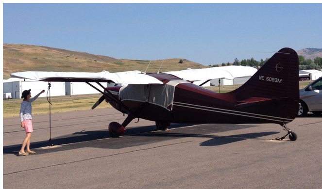
Stinson 108 Canopy Cover & Wing Covers