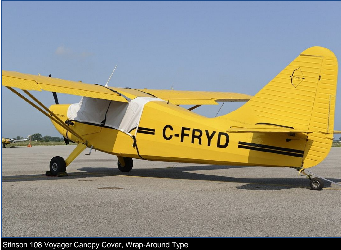
Stinson 108 Voyager Canopy Cover, Wrap-Around Type