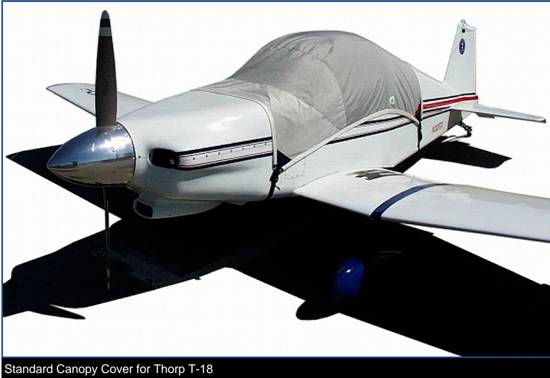
Standard Canopy Cover for Thorp T-18