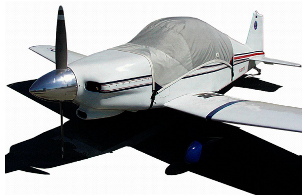
Standard Canopy Cover for Thorp T-18

Cover and Engine Cover. This cover will enclose the engine cowl and will extend aft to cover all of the windows. This cover type is made from Silver Acrylic Sunbrella canvas and is 100% lined with a soft and smooth microfiber. Bruce's Custom Covers developed this material combination especially for aircraft protection. The outer material is medium weight and treated for water resistance, UV resistance and anti-static buildup. The inner lining is a very soft and smooth microfiber to prevent scratching. The material is very reflective, and tests show that the cabin interior temperature can be reduced to near-ambient temperature on the hottest of days. It is water, ice and snow repellent, yet breathable to allow moisture to escape from between the cover and the aircraft surface.