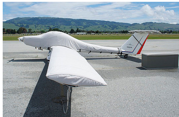
Lambada Canopy/Engine Cover and Wing Covers Grob 109 Canopy/Engine w/ extension to tail, Wing, Stabilizer & Prop/Spinner Covers