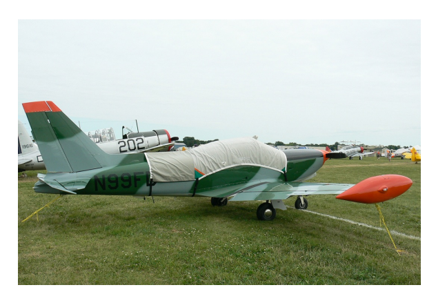
Siai Marchetti SF260 Canopy Cover with aft extension

Travel Covers are made with Silver Solution-Dyed Polyester fabric and only lined over the windshield to save weight. The material is lightweight and more compact for easy stowage in the aircraft. The polyester material is water resistant, but only intended for occasional use outside. We also have an ultra lightweight material available for fitted hangar dust covers. For daily outdoor use, the non-travel Sunbrella Cover is the best choice.