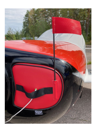
Siai Marchetti SF260 Engine Plugs