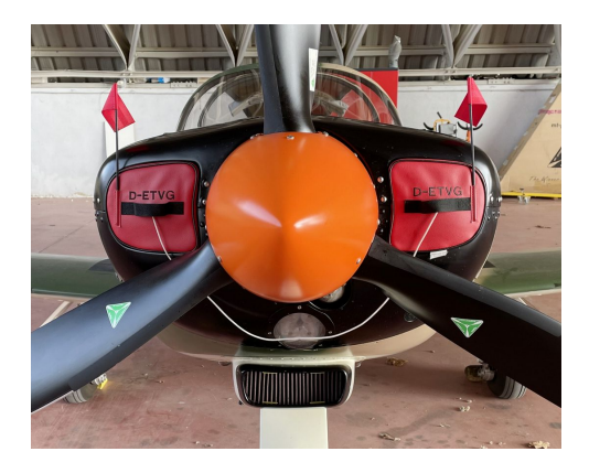
Marcheti SF260C Inlet Plugs

Engine Inlet Plugs are custom fit for your Siai Marchetti SF260 intakes, made with heavy-duty vinyl material, and stuffed with a single block of sculpted urethane foam. Each plug has a zipper that allows the foam to be removed and dried if necessary. Engine plugs have warning flags that are visible from the cockpit or 'remove before flight' streamers sewn onto the face of the plugs. Most plugs are imprinted with the aircraft registration number in black for an extra charge. Storage bag NOT included. Engine plugs may be inserted after flight when the engine is still warm. Engine Inlet Plugs are commonly referred to as Cowl Plugs, Intake Plugs, Cowl Blocks, Engine Blocks, and Engine Bungs.