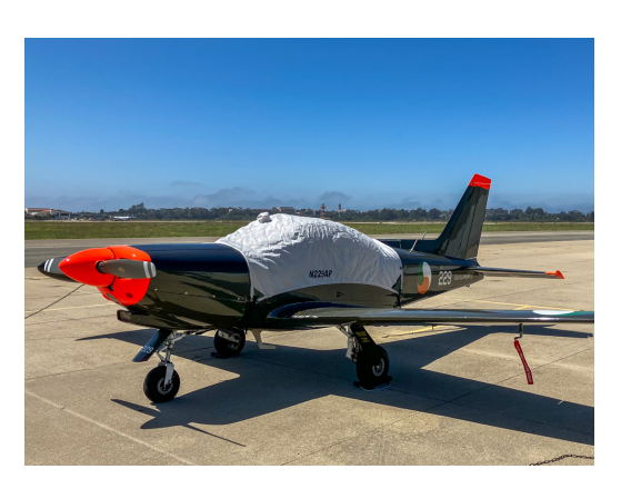
Siai Marchetti SF260 Canopy Cover