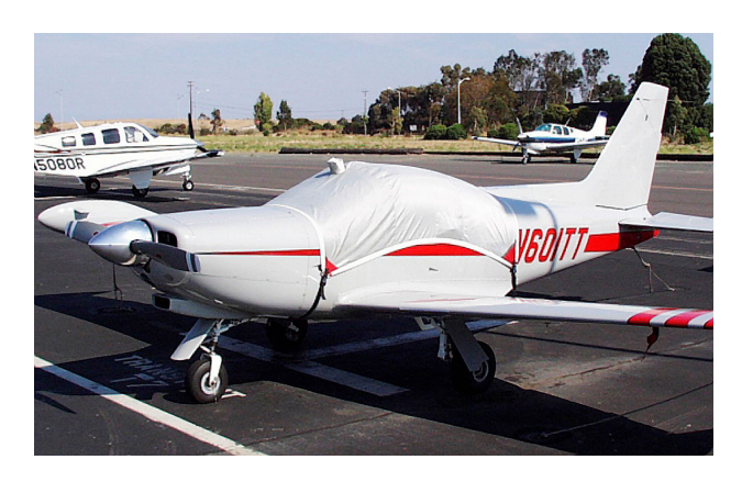
Standard Canopy Cover for Marchetti SF260