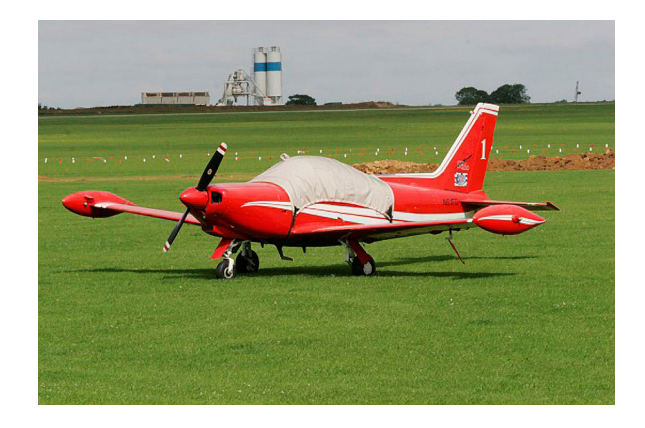
Siai Marchetti SF260 Canopy Cover

This cover type is made from Silver Acrylic Sunbrella canvas and is 100% lined with a soft and smooth microfiber. Bruce's Custom Covers developed this material combination especially for aircraft protection. The outer material is medium weight and treated for water resistance, UV resistance and anti-static buildup. The inner lining is a very soft and smooth microfiber to prevent scratching. The material is very reflective, and tests show that the cabin interior temperature can be reduced to near-ambient temperature on the hottest of days. It is water, ice and snow repellent, yet breathable to allow moisture to escape from between the cover and the aircraft surface.