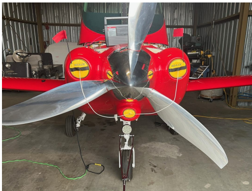
Swearingen SX-300 Engine Plugs

Engine Inlet Plugs are custom fit for your Swearingen SX300 intakes, made with heavy-duty vinyl material, and stuffed with a single block of sculpted urethane foam. Each plug has a zipper that allows the foam to be removed and dried if necessary. Engine plugs have warning flags that are visible from the cockpit or 'remove before flight' streamers sewn onto the face of the plugs. Most plugs are imprinted with the aircraft registration number in black for an extra charge. Storage bag NOT included. Engine plugs may be inserted after flight when the engine is still warm. Engine Inlet Plugs are commonly referred to as Cowl Plugs, Intake Plugs, Cowl Blocks, Engine Blocks, and Engine Bungs.