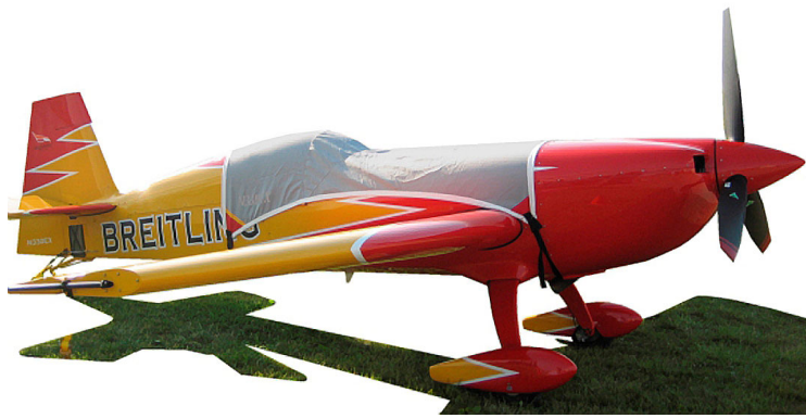
Extra 300sc Canopy Cover