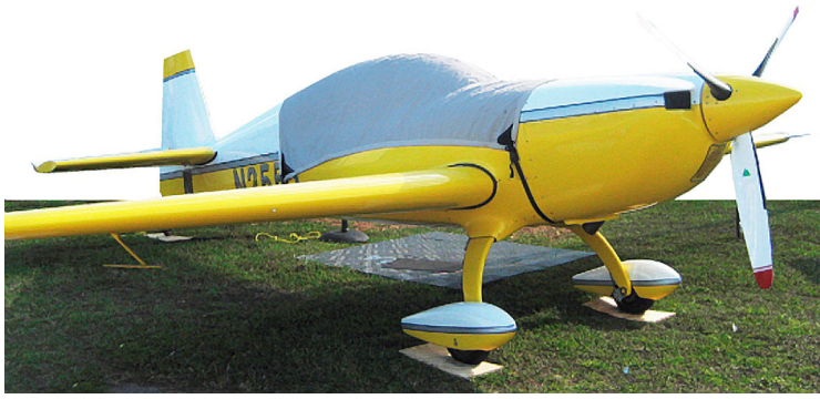
Extra 300/L Canopy Cover