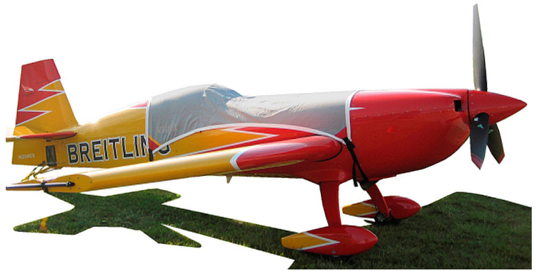
Extra 300sc Canopy Cover