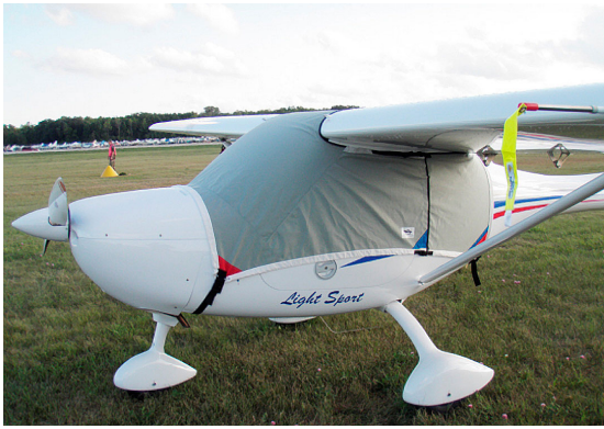
Remos G3 Travel Weight Canopy Cover