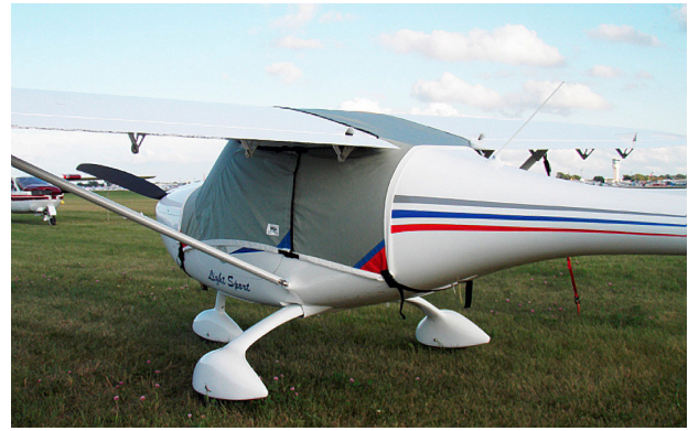
Remos G3 Travel Weight Canopy Cover