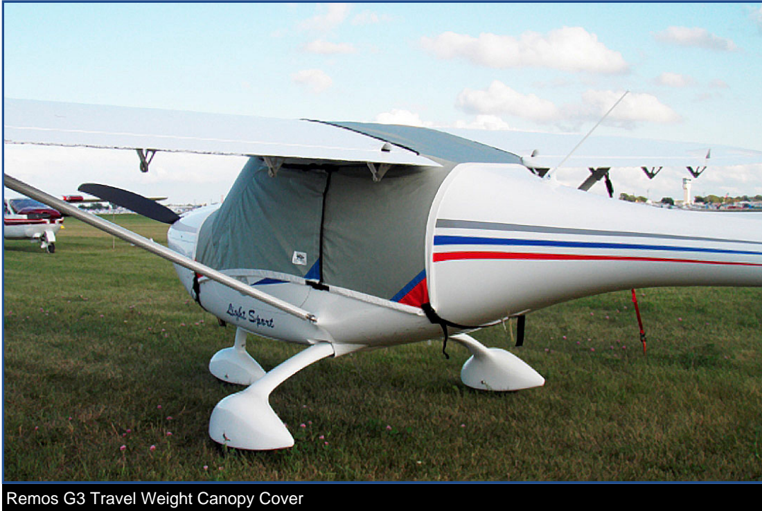
Remos G3 Travel Weight Canopy Cover