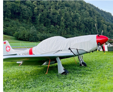
Stewart S-51 Canopy & Engine Covers