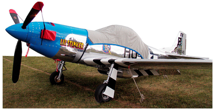
Stewart Mustang Canopy Cover, Prop Tie Downs & Intake Plugs