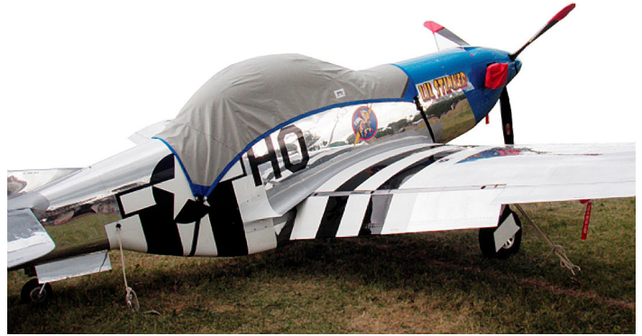
Stewart Mustang Canopy Cover, Prop Tie Downs & Intake Plugs Stewart Mustang Canopy Cover, Prop Tie Downs & Intake Plugs