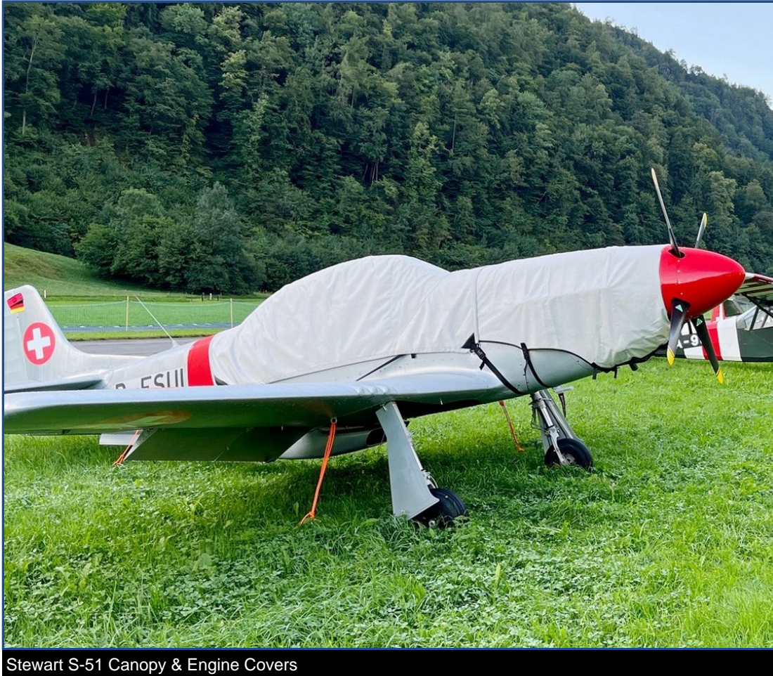
Stewart S-51 Canopy &amp; Engine Covers