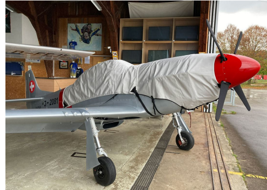
SW-51 Mustang Canopy & Engine Covers