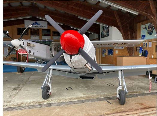
SW-51 Mustang Engine Cover