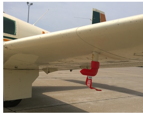
Mooney Pitot Cover