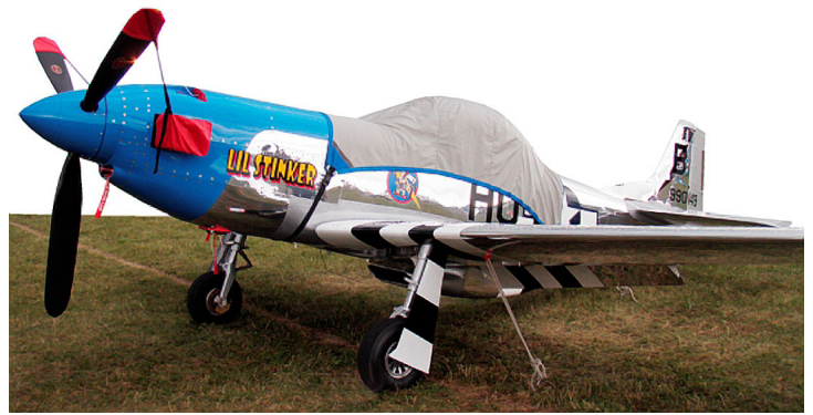
Stewart Mustang Canopy Cover, Prop Tie Downs & Intake Plugs Stewart Mustang Canopy Cover, Prop Tie Downs & Intake Plugs