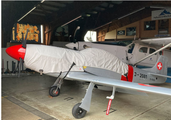
SW-51 Mustang Canopy & Engine Covers

This cover type is made from Silver Acrylic Sunbrella canvas and is 100% lined with a soft and smooth microfiber. Bruce's Custom Covers developed this material combination especially for aircraft protection. The outer material is medium weight and treated for water resistance, UV resistance and anti-static buildup. The inner lining is a very soft and smooth microfiber to prevent scratching. The material is very reflective, and tests show that the cabin interior temperature can be reduced to near-ambient temperature on the hottest of days. It is water, ice and snow repellent, yet breathable to allow moisture to escape from between the cover and the aircraft surface.