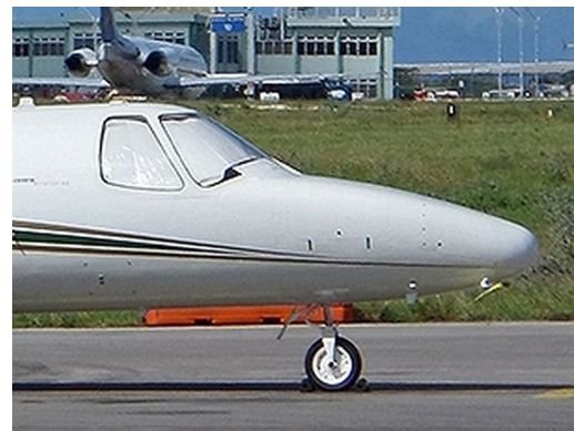
Cessna Citation S550 Cockpit HeatShields