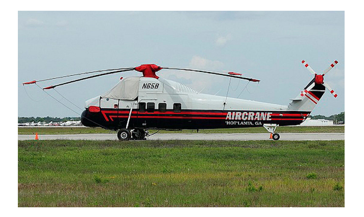
S58 Cockpit Windshield, Main Rotor, Particle Separator, Exhaust Covers, Intake Plugs and Blade Tie-downs