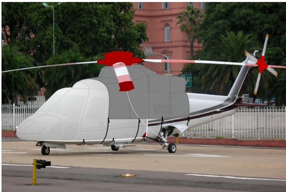
S76 Forward Fuselage, Engine, Main & Tail Rotor Hub Covers (illustration)

WINTER USE MATERIAL - Made with Solution-Dyed Polyester fabric, this option is intended for seasonal use to aid in deicing, rain mitigation, or for occasional travel. The material is lighter and more compact, but more susceptible to UV damage and may have a shorter useful life if used continuously outside than the all-year use material.