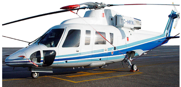
S76 Blade Tie-Downs and Pitot Cover set