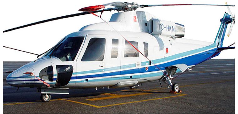
S76 Blade Tie-Downs and Pitot Cover set