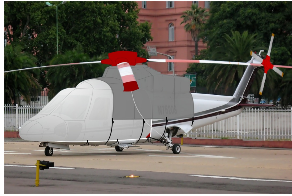
Sikorsky S76 Bubble Cover (Forward Canopy Cover) S76 Forward Fuselage, Engine, Main & Tail Rotor Hub Covers (illustration)