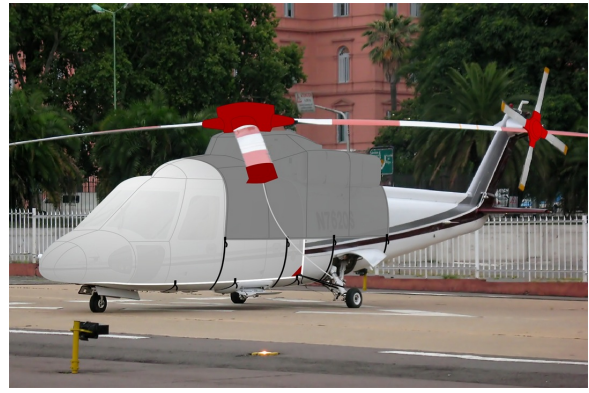
S76 Forward Fuselage, Engine, Main & Tail Rotor Hub Covers (illustration)