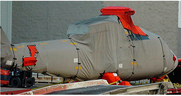
S76 Full Body Transport Cover