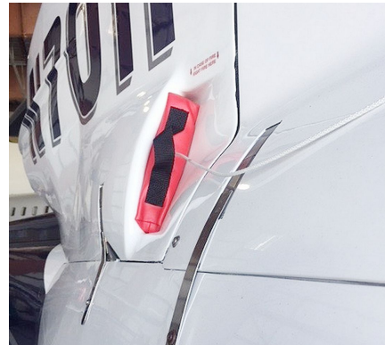
Sikorsky S76 (All Models) Intake Plugs (S76c Models)