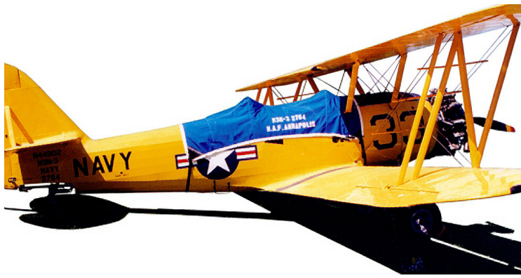
N3N Canopy Cover