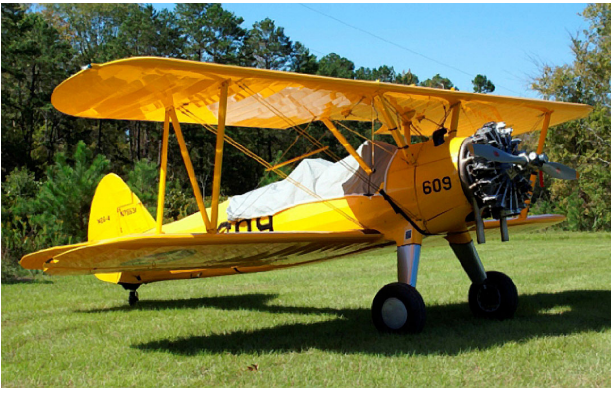
Stearman Canopy Cover