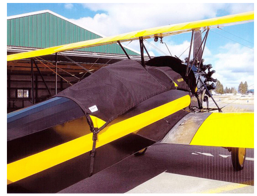
Stearman C3 Canopy Cover