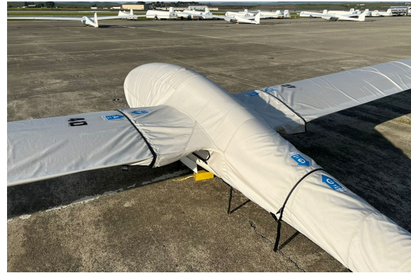
Schempp-Hirth Discus 2B Complete Cover Set