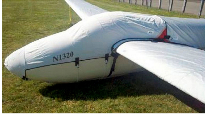
Schweizer SGS 1-26B Canopy/Nose, Wings & Empennage Covers