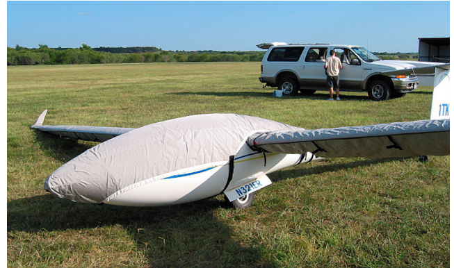
Canopy/Nose Cover, Wings and Horizontal Stab Covers