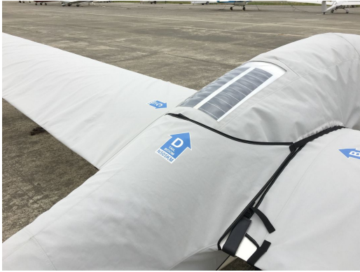
DG-505 Full Cover Set