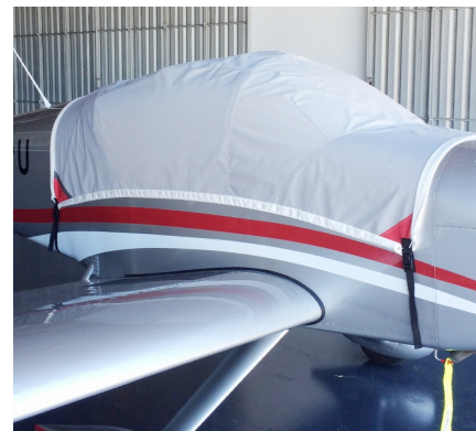
Vans's RV-9 Light Weight Travel Canopy Cover