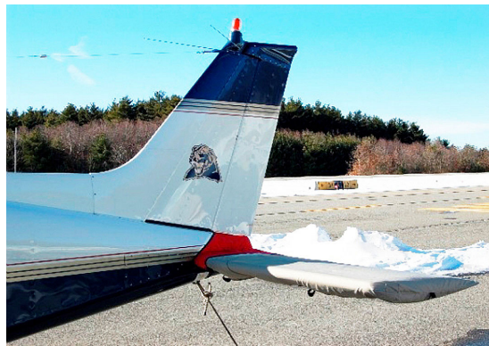
Tailcone & Horizontal Stabilizer Covers

WINTER USE MATERIAL - Made with Solution-Dyed Polyester fabric, this option is intended for seasonal use to aid in deicing, rain mitigation, or for occasional travel. The material is lighter and more compact, but more susceptible to UV damage and may have a shorter useful life if used continuously outside than the all-year use material.