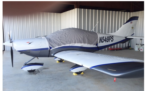
PiperSport Light Weight Travel Cover