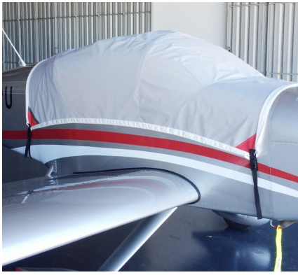
Vans's RV-9 Light Weight Travel Canopy Cover