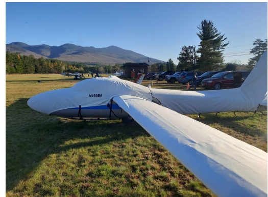
Schweizer 2-32 Full Cover Set