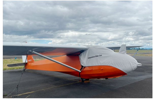
Schweizer SGS, SGU, 1 & 2 Models Canopy/Nose Cover, 1-23, All Year Use