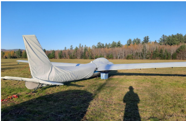
Schweizer 2-32 Full Cover Set

WINTER USE MATERIAL - Made with Solution-Dyed Polyester fabric, this option is intended for seasonal use to aid in deicing, rain mitigation, or for occasional travel. The material is lighter and more compact, but more susceptible to UV damage and may have a shorter useful life if used continuously outside than the all-year use material.