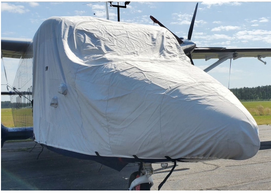
Short Brothers Sherpa, Skyvan, 330 & 360 (C-23) Forward Fuselage/Nose Cover