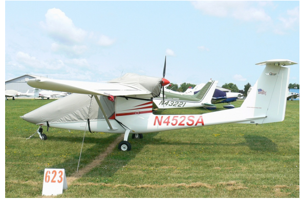
Sky Arrow Canopy & Engine Covers