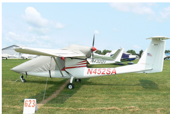
Sky Arrow Canopy & Engine Covers

This cover type is made from Silver Acrylic Sunbrella canvas and is 100% lined with a soft and smooth microfiber. Bruce's Custom Covers developed this material combination especially for aircraft protection. The outer material is medium weight and treated for water resistance, UV resistance and anti-static buildup. The inner lining is a very soft and smooth microfiber to prevent scratching. The material is very reflective, and tests show that the cabin interior temperature can be reduced to near-ambient temperature on the hottest of days. It is water, ice and snow repellent, yet breathable to allow moisture to escape from between the cover and the aircraft surface.