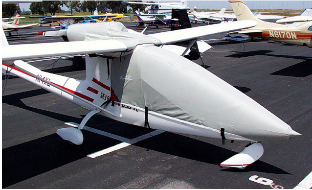
Sky Arrow Canopy & Engine Covers

This cover type is made from Silver Acrylic Sunbrella canvas and is 100% lined with a soft and smooth microfiber. Bruce's Custom Covers developed this material combination especially for aircraft protection. The outer material is medium weight and treated for water resistance, UV resistance and anti-static buildup. The inner lining is a very soft and smooth microfiber to prevent scratching. The material is very reflective, and tests show that the cabin interior temperature can be reduced to near-ambient temperature on the hottest of days. It is water, ice and snow repellent, yet breathable to allow moisture to escape from between the cover and the aircraft surface.