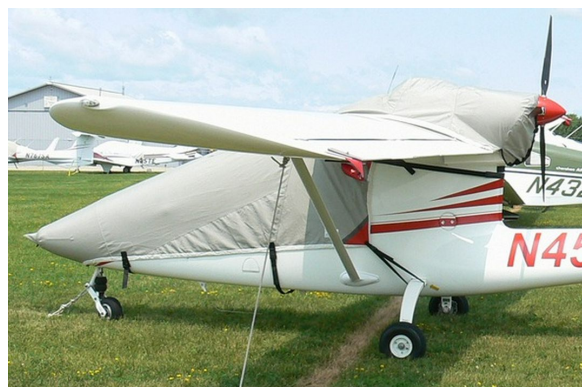
Sky Arrow Canopy/Nose & Engine Covers