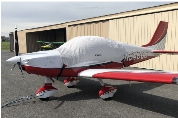
Airplane Factory Sling 2 Canopy Cover

This cover type is made from Silver Acrylic Sunbrella canvas and is 100% lined with a soft and smooth microfiber. Bruce's Custom Covers developed this material combination especially for aircraft protection. The outer material is medium weight and treated for water resistance, UV resistance and anti-static buildup. The inner lining is a very soft and smooth microfiber to prevent scratching. The material is very reflective, and tests show that the cabin interior temperature can be reduced to near-ambient temperature on the hottest of days. It is water, ice and snow repellent, yet breathable to allow moisture to escape from between the cover and the aircraft surface.