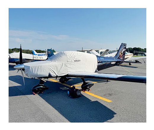
Sling TSI Extended Canopy/Engine Cover

This cover type is made from Silver Acrylic Sunbrella canvas and is 100% lined with a soft and smooth microfiber. Bruce's Custom Covers developed this material combination especially for aircraft protection. The outer material is medium weight and treated for water resistance, UV resistance and anti-static buildup. The inner lining is a very soft and smooth microfiber to prevent scratching. The material is very reflective, and tests show that the cabin interior temperature can be reduced to near-ambient temperature on the hottest of days. It is water, ice and snow repellent, yet breathable to allow moisture to escape from between the cover and the aircraft surface.