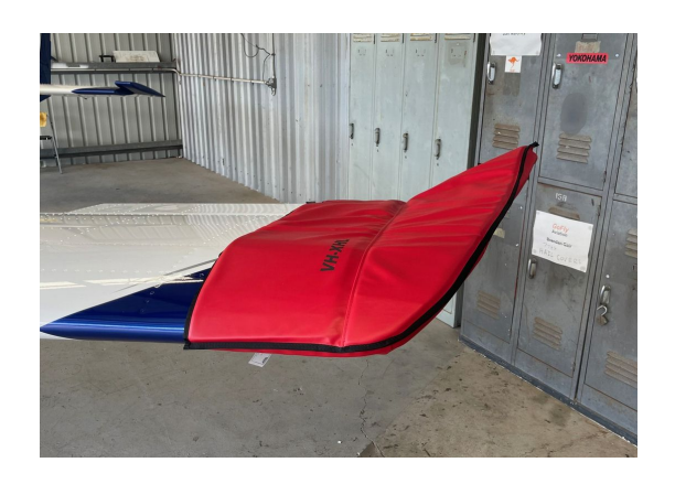
Sling TSI Wingtip Pads