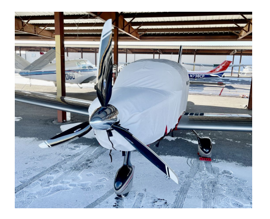
Airplane Factory Sling TSI Extended Canopy/Engine Cover