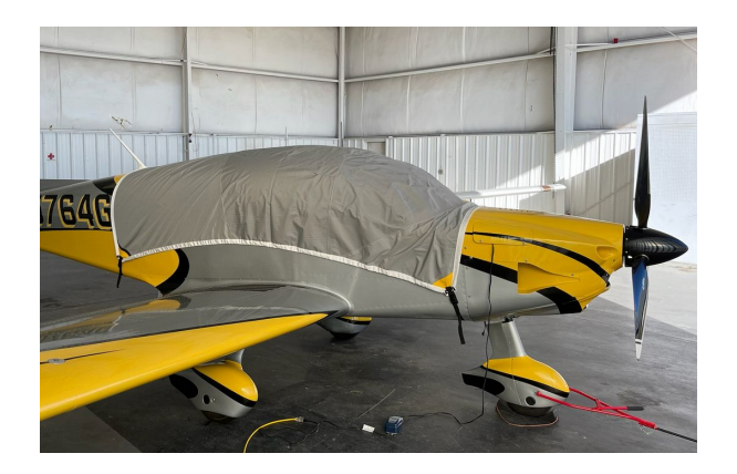
Sling TSI Travel Weight Canopy Cover