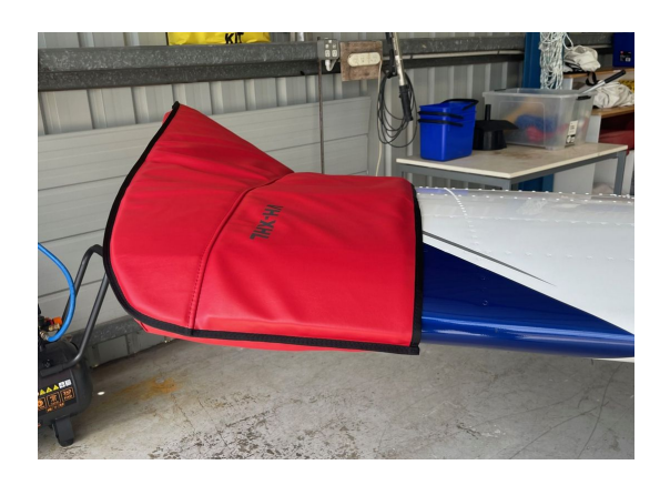
Sling TSI Wingtip Pads