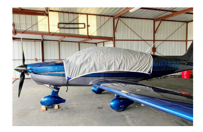
Sling 4 TSI Light Weight Travel Cover

Travel Covers are made with Silver Solution-Dyed Polyester fabric and only lined over the windshield to save weight. The material is lightweight and more compact for easy stowage in the aircraft. The polyester material is water resistant, but only intended for occasional use outside. We also have an ultra lightweight material available for fitted hangar dust covers. For daily outdoor use, the non-travel Sunbrella Cover is the best choice.