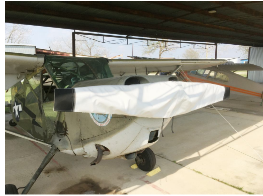
Stinson L-5 Sentinel Propellor/Spinner Cover