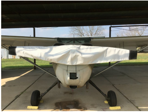
Stinson L-5 Sentinel Propellor/Spinner Cover

the hottest of days. It is water, ice and snow repellent, yet breathable to allow moisture to escape from between the cover and the aircraft surface.