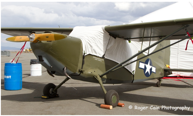
Stinson L-5 Canopy Cover