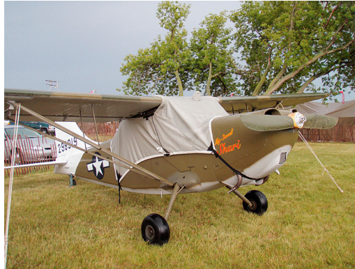
Stinson L-5 Canopy Cover

This cover type is made from Silver Acrylic Sunbrella canvas and is 100% lined with a soft and smooth microfiber. Bruce's Custom Covers developed this material combination especially for aircraft protection. The outer material is medium weight and treated for water resistance, UV resistance and anti-static buildup. The inner lining is a very soft and smooth microfiber to prevent scratching. The material is very reflective, and tests show that the cabin interior temperature can be reduced to near-ambient temperature on the hottest of days. It is water, ice and snow repellent, yet breathable to allow moisture to escape from between the cover and the aircraft surface.