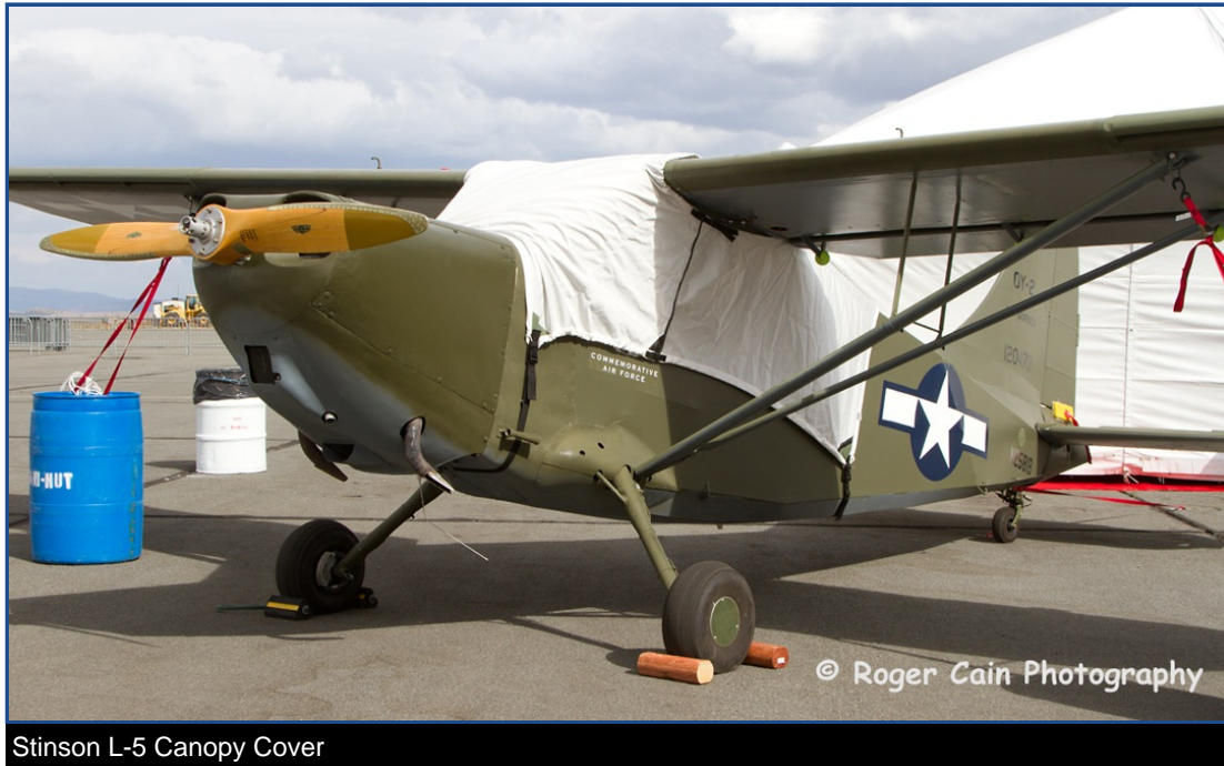
Stinson L-5 Canopy Cover