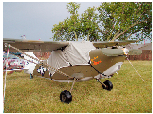
Stinson L-5 Canopy Cover