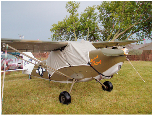
Stinson L-5 Canopy Cover