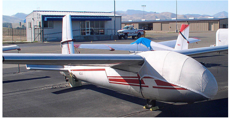
Blanik L13 Canopy/Nose Cover