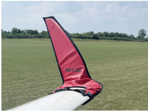
Schempp-Hirth Ventus-2B winglet/wingtip pads