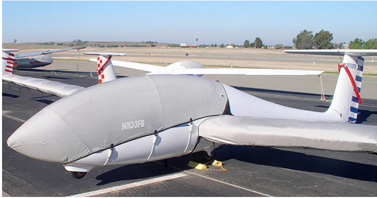
Grob 103 Canopy/Nose Cover and Wing Covers