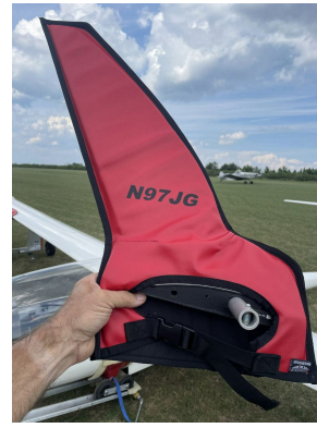
Schempp-Hirth Ventus-2B winglet/wingtip pads