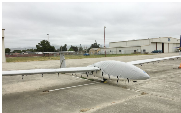
DG-505 Canopy/Nose, Wing, Empennage & Horiz. Stab. Covers