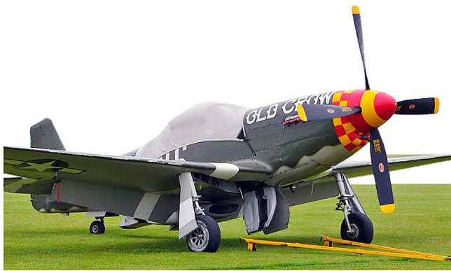
Canopy Cover, Chin Scoop & Exhaust Plugs