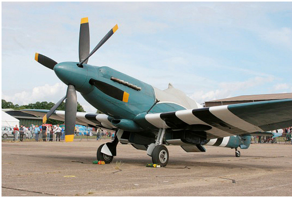
Supermarine Spitfire XIX Canopy Cover