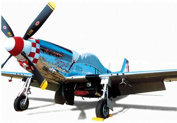
Canopy Cover, Belly & Chin Scoop Plugs