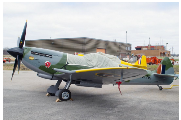
Supermarine Spitfire Mk 14 Canopy Cover