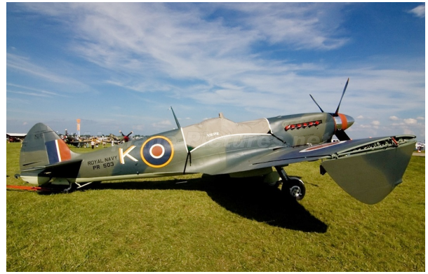
Supermarine Spitfire Mk IX Canopy Cover