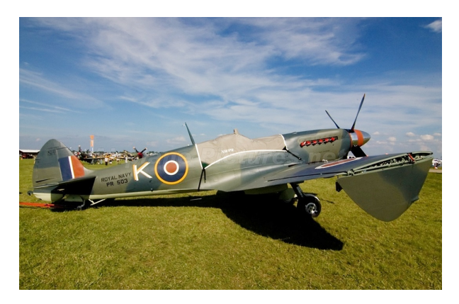
Supermarine Spitfire Mk IX Canopy Cover