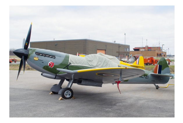
Supermarine Spitfire Mk 14 Canopy Cover

Travel Covers are made with Silver Solution-Dyed Polyester fabric and only lined over the windshield to save weight. The material is lightweight and more compact for easy stowage in the aircraft. The polyester material is water resistant, but only intended for occasional use outside. We also have an ultra lightweight material available for fitted hangar dust covers. For daily outdoor use, the non-travel Sunbrella Cover is the best choice.