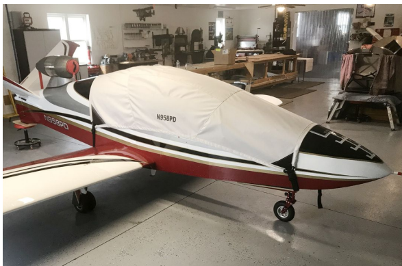
Subsonex Canopy Cover

This cover type is made from Silver Acrylic Sunbrella canvas and is 100% lined with a soft and smooth microfiber. Bruce's Custom Covers developed this material combination especially for aircraft protection. The outer material is medium weight and treated for water resistance, UV resistance and anti-static buildup. The inner lining is a very soft and smooth microfiber to prevent scratching. The material is very reflective, and tests show that the cabin interior temperature can be reduced to near-ambient temperature on the hottest of days. It is water, ice and snow repellent, yet breathable to allow moisture to escape from between the cover and the aircraft surface.