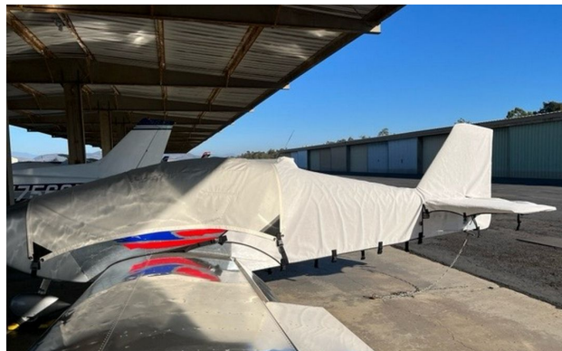
Sonex Empennage Cover, & Canopy Cover

WINTER USE MATERIAL - Made with Solution-Dyed Polyester fabric, this option is intended for seasonal use to aid in deicing, rain mitigation, or for occasional travel. The material is lighter and more compact, but more susceptible to UV damage and may have a shorter useful life if used continuously outside than the all-year use material.