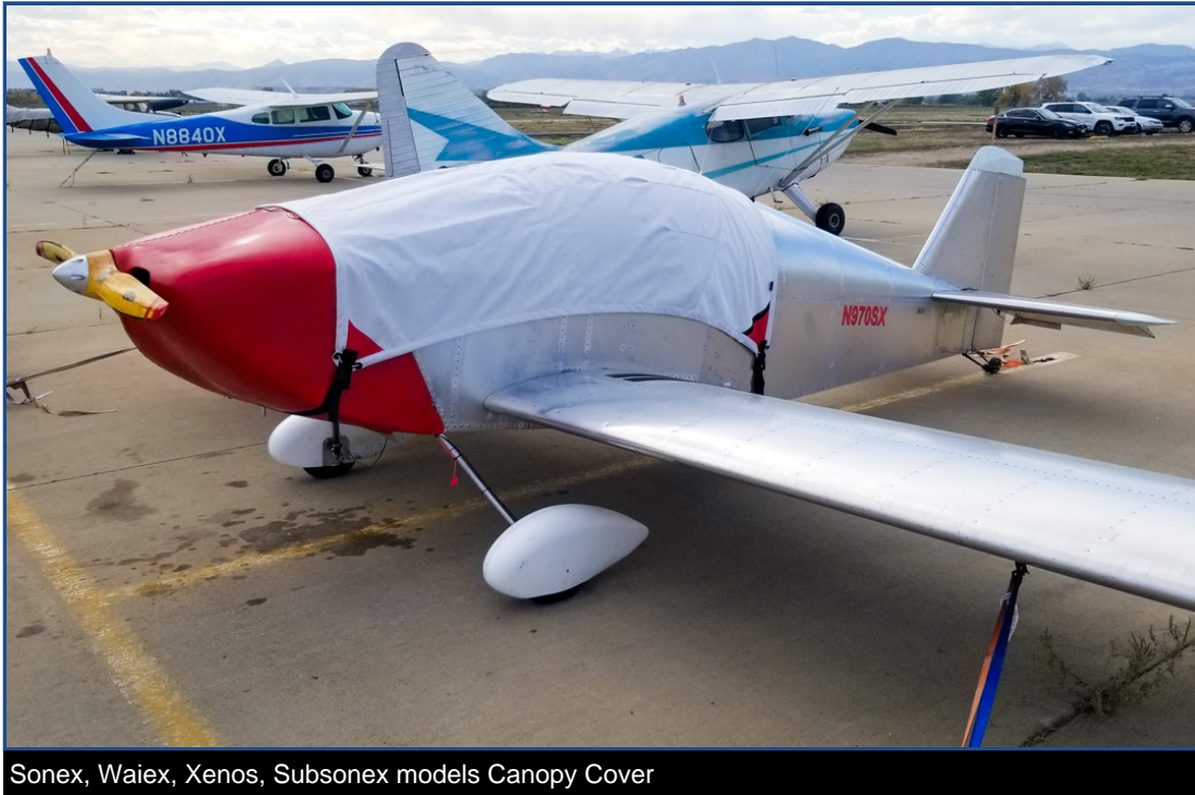
Sonex, Waix, Xenos, Subsonex models Canopy Cover