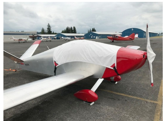
Sonex Xenos Canopy & Prop Cover