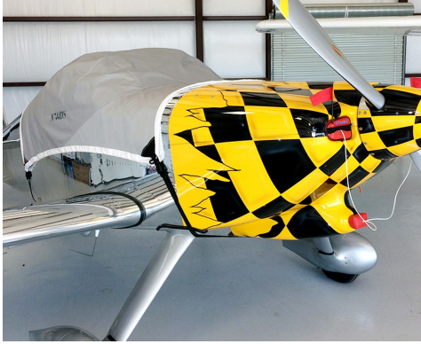
Van's RV-7 Engine Inlet Plugs

Engine Inlet Plugs are custom fit for your Sorrell Hiperbipe SNS-7 intakes, made with heavy-duty vinyl material, and stuffed with a single block of sculpted urethane foam. Each plug has a zipper that allows the foam to be removed and dried if necessary. Engine plugs have warning flags that are visible from the cockpit or 'remove before flight' streamers sewn onto the face of the plugs. Most plugs are imprinted with the aircraft registration number in black for an extra charge. Storage bag NOT included. Engine plugs may be inserted after flight when the engine is still warm. Engine Inlet Plugs are commonly referred to as Cowl Plugs, Intake Plugs, Cowl Blocks, Engine Blocks, and Engine Bungs.