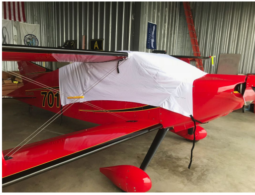
Sorrell Hiperbipe Canopy Cover (test fit cover)