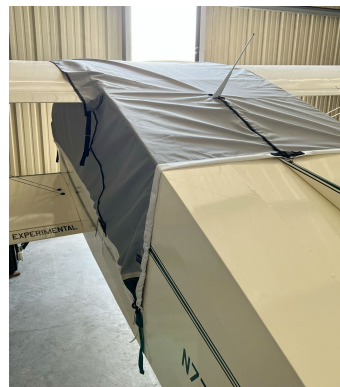
Sorrell SNS-7 Hiperbipe Over The Top Travel Canopy Cover