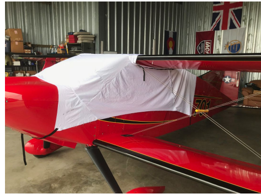
Sorrell Hiperbipe Canopy Cover (test fit cover)