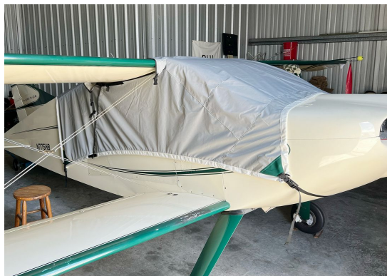
Sorrell SNS-7 Hiperbipe Over The Top Travel Canopy Cover

Travel Covers are made with Silver Solution-Dyed Polyester fabric and only lined over the windshield to save weight. The material is lightweight and more compact for easy stowage in the aircraft. The polyester material is water resistant, but only intended for occasional use outside. We also have an ultra lightweight material available for fitted hangar dust covers. For daily outdoor use, the non-travel Sunbrella Cover is the best choice.