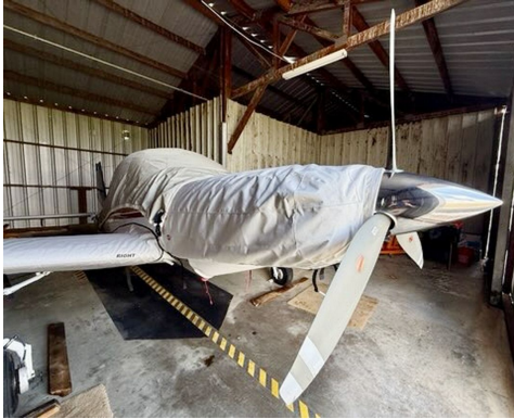
Micco SP20 Engine Cover

WINTER USE MATERIAL - Made with Solution-Dyed Polyester fabric, this option is intended for seasonal use to aid in deicing, rain mitigation, or for occasional travel. The material is lighter and more compact, but more susceptible to UV damage and may have a shorter useful life if used continuously outside than the all-year use material.