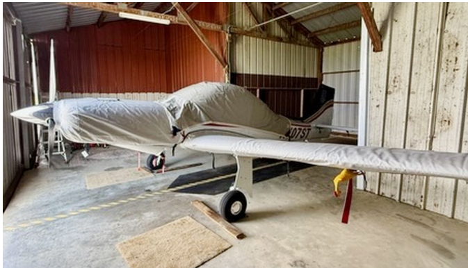
Micco SP20 Wing and Engine Covers

This cover type is made from Silver Acrylic Sunbrella canvas and is 100% lined with a soft and smooth microfiber. Bruce's Custom Covers developed this material combination especially for aircraft protection. The outer material is medium weight and treated for water resistance, UV resistance and anti-static buildup. The inner lining is a very soft and smooth microfiber to prevent scratching. The material is very reflective, and tests show that the cabin interior temperature can be reduced to near-ambient temperature on the hottest of days. It is water, ice and snow repellent, yet breathable to allow moisture to escape from between the cover and the aircraft surface.