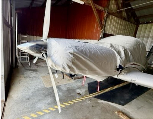
Micco SP20 Engine Cover

The Micco SP20 Canopy/Engine Cover is a one-piece cover (100% lined with microfiber) that is a combination of the Canopy Cover and Engine Cover. This cover will enclose the engine cowl and will extend aft to cover all of the windows. This cover type is made from Silver Acrylic Sunbrella canvas and is 100% lined with a soft and smooth microfiber. Bruce's Custom Covers developed this material combination especially for aircraft protection. The outer material is medium weight and treated for water resistance, UV resistance and anti-static buildup. The inner lining is a very soft and smooth microfiber to prevent scratching. The material is very reflective, and tests show that the cabin interior temperature can be reduced to near-ambient temperature on the hottest of days. It is water, ice and snow repellent, yet breathable to allow moisture to escape from between the cover and the aircraft surface.