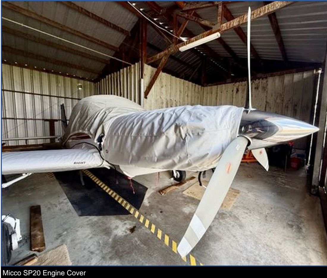
Micco SP20 Engine Cover