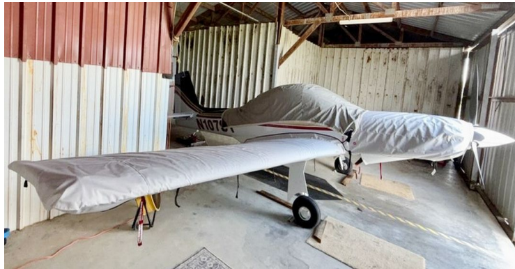
Micco SP20 Canopy Wing & Engine Covers