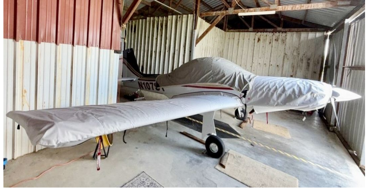
Micco SP20 Canopy Wing & Engine Covers