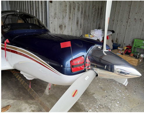
Micco SP-20 Engine Plugs

inserted after flight when the engine is still warm. Engine Inlet Plugs are commonly referred to as Cowl Plugs, Intake Plugs, Cowl Blocks, Engine Blocks, and Engine Bungs.