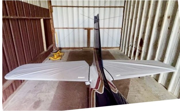
Micco SP20 Horizontal Stabilizer Covers