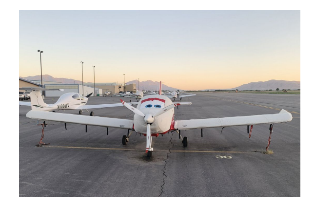
SportCruiser Canopy/Engine & Wing Covers

This cover type is made from Silver Acrylic Sunbrella canvas and is 100% lined with a soft and smooth microfiber. Bruce's Custom Covers developed this material combination especially for aircraft protection. The outer material is medium weight and treated for water resistance, UV resistance and anti-static buildup. The inner lining is a very soft and smooth microfiber to prevent scratching. The material is very reflective, and tests show that the cabin interior temperature can be reduced to near-ambient temperature on the hottest of days. It is water, ice and snow repellent, yet breathable to allow moisture to escape from between the cover and the aircraft surface.