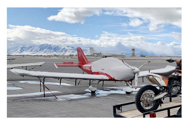
Czech Aircraft SportCruiser Canopy/Engine & Wing Covers