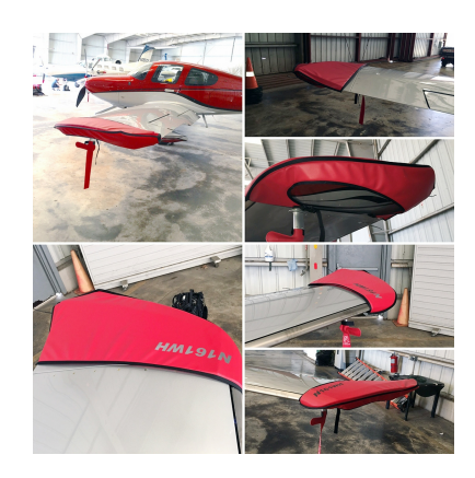
Cirrus SR22 Wingtip Pads, G5 Models

Designed to prevent damage to the aircraft extremities in crowded hangars, these products are made of bright red Naugahyde and thickly padded with a sandwich of closed cell foam.