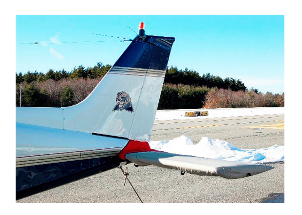
Tailcone & Horizontal Stabilizer Covers