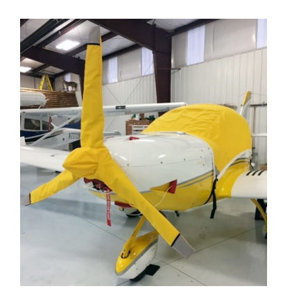
Custom Yellow Canopy Cover, Prop/Spinner, and Inlet Plugs