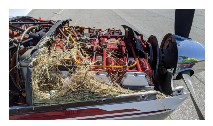
Custom Yellow Canopy Cover, Prop/Spinner, and ENGINE PLUGS PREVENT BIRD NEST FOD. Piper Saratoga Engine Cowling Inlet Plugs Bird's Nest