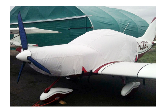
Czech Aircraft Works SportCruiser Canopy/Engine Cover