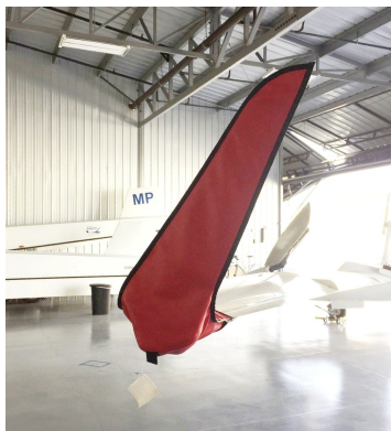
Schleicher ASH Wingtip Pads

Designed to prevent damage to the wingtip in crowded hangars or high traffic areas, these products are made of bright red Naugahyde and thickly padded with a sandwich of closed cell foam. Protects delicate winglets, casters and their housings, and soft finishes.