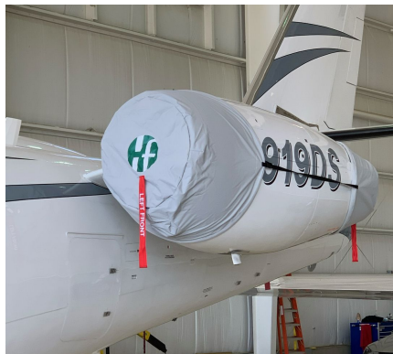
ASTRA SPX Engine Covers with TR's

The Israel Aircraft Industries Astra SPX Bikini Style Engine Covers are a single-piece design using a soft and smooth stretchy and fabric. The cover stretches tightly over both the intake and exhaust, installing quickly and easily. These covers are designed to be used as hangar dust covers and have a useful life of approximately one year.