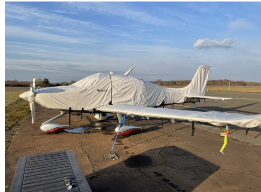
Cirrus SR-22 Complete Cover Set