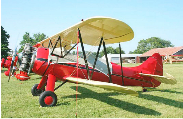
Waco YMF Canopy Cover

The Spezio Tuholer Canopy/Engine Cover is a one-piece cover (100% lined with microfiber) that is a combination of the Canopy Cover and Engine Cover. This cover will enclose the engine cowl and will extend aft to cover all of the windows. This cover type is made from Silver Acrylic Sunbrella canvas and is 100% lined with a soft and smooth microfiber. Bruce's Custom Covers developed this material combination especially for aircraft protection. The outer material is medium weight and treated for water resistance, UV resistance and anti-static buildup. The inner lining is a very soft and smooth microfiber to prevent scratching. The material is very reflective, and tests show that the cabin interior temperature can be reduced to near-ambient temperature on the hottest of days. It is water, ice and snow repellent, yet breathable to allow moisture to escape from between the cover and the aircraft surface.