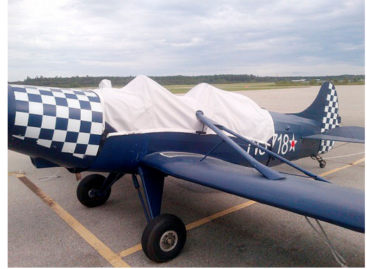
Spezio Tuholer Canopy Cover