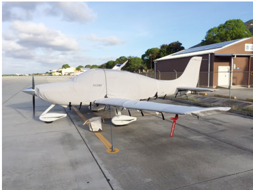
Cirrus SR-22 Full Cover Set

WINTER USE MATERIAL - Made with Solution-Dyed Polyester fabric, this option is intended for seasonal use to aid in deicing, rain mitigation, or for occasional travel. The material is lighter and more compact, but more susceptible to UV damage and may have a shorter useful life if used continuously outside than the all-year use material.