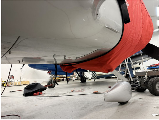
Cirrus SR-22 Insulated Engine Cover