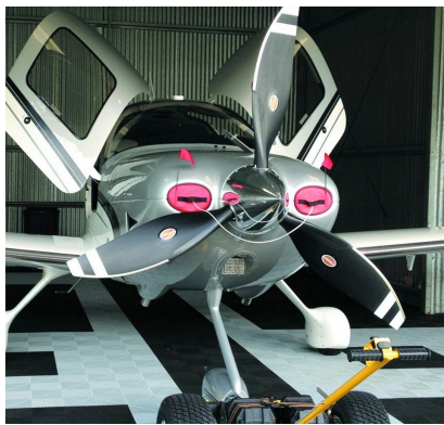
Cirrus SR22 Engine Inlet Plugs