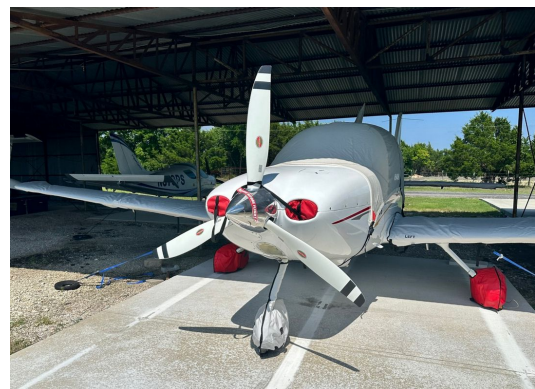
Cirrus SR-22 Wheelpan Cover