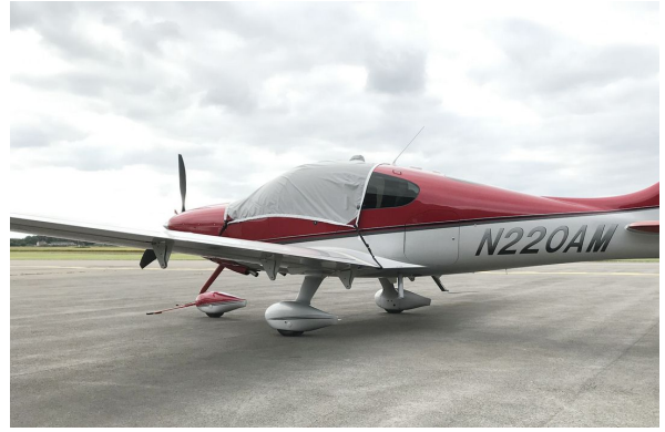
Cirrus SR-22 Cockpit Cover