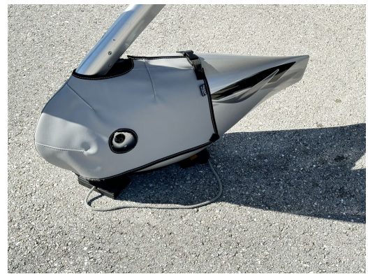
Cirrus SR22 Abbreviated Front Wheelpant (For Tow Bar Protection) Cirrus SR22 Nose Wheelpant Cover for Tow Bar Protection