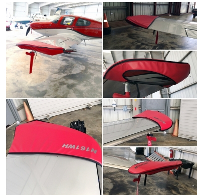
Cirrus SR22 Wingtip Pads, G5 Models