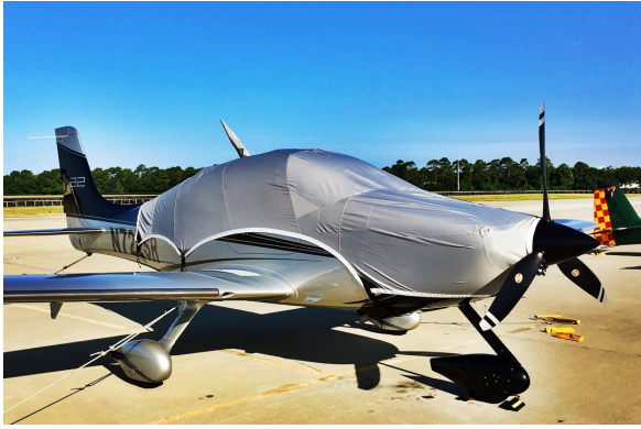
Cirrus SR22 Light Weight Travel Canopy/Engine Cover

non-travel Sunbrella Cover is the best choice.