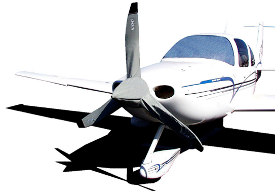
Cirrus SR-22 Propellor/Spinner Cover & Windshield Heatshield