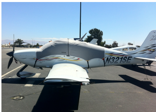
Cirrus SR-22 Light Weight Travel Cover

This cover type is made from Silver Acrylic Sunbrella canvas and is 100% lined with a soft and smooth microfiber. Bruce's Custom Covers developed this material combination especially for aircraft protection. The outer material is medium weight and treated for water resistance, UV resistance and anti-static buildup. The inner lining is a very soft and smooth microfiber to prevent scratching. The material is very reflective, and tests show that the cabin interior temperature can be reduced to near-ambient temperature on the hottest of days. It is water, ice and snow repellent, yet breathable to allow moisture to escape from between the cover and the aircraft surface.