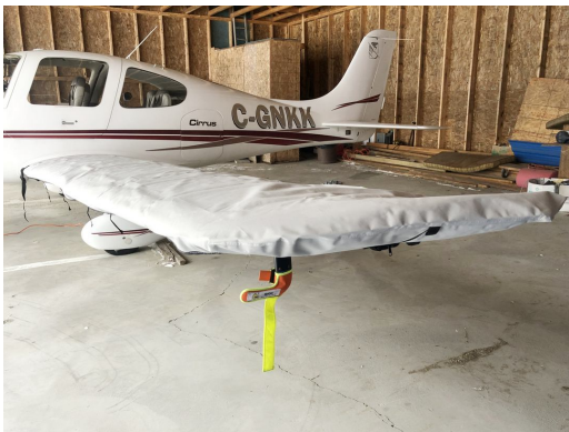
Cirrus SR20 Wing Covers Winter Use with Imprint

WINTER USE MATERIAL - Made with Solution-Dyed Polyester fabric, this option is intended for seasonal use to aid in deicing, rain mitigation, or for occasional travel. The material is lighter and more compact, but more susceptible to UV damage and may have a shorter useful life if used continuously outside than the all-year use material.