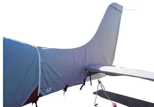
Cirrus SR20 Empennage Cover (covers tail boom, vertical and horizontal stabilizers)