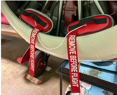
Beech Staggerwing Carb Inlet Plugs, Located Inside Engine

Engine Inlet Plugs are custom fit for your Beech Staggerwing intakes, made with heavy-duty vinyl material, and stuffed with a single block of sculpted urethane foam. Each plug has a zipper that allows the foam to be removed and dried if necessary. Engine plugs have warning flags that are visible from the cockpit or 'remove before flight' streamers sewn onto the face of the plugs. Most plugs are imprinted with the aircraft registration number in black for an extra charge. Storage bag NOT included. Engine plugs may be inserted after flight when the engine is still warm. Engine Inlet Plugs are commonly referred to as Cowl Plugs, Intake Plugs, Cowl Blocks, Engine Blocks, and Engine Bungs.