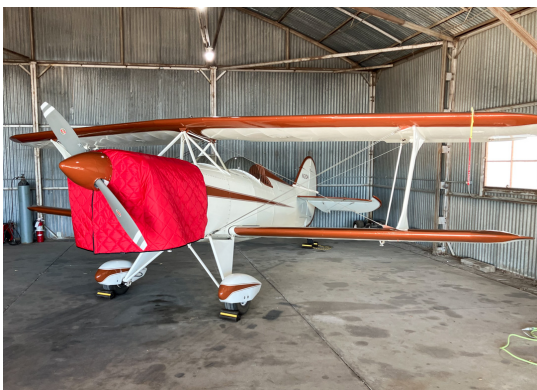
SKYBOLT, Insulated Hangar Blanket, Custom Fit Interior Use)

This cover type is made from Silver Acrylic Sunbrella canvas and is 100% lined with a soft and smooth microfiber. Bruce's Custom Covers developed this material combination especially for aircraft protection. The outer material is medium weight and treated for water resistance, UV resistance and anti-static buildup. The inner lining is a very soft and smooth microfiber to prevent scratching. The material is very reflective, and tests show that the cabin interior temperature can be reduced to near-ambient temperature on the hottest of days. It is water, ice and snow repellent, yet breathable to allow moisture to escape from between the cover and the aircraft surface.