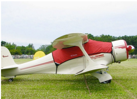
Beech Staggerwing Canopy Cover

This cover type is made from Silver Acrylic Sunbrella canvas and is 100% lined with a soft and smooth microfiber. Bruce's Custom Covers developed this material combination especially for aircraft protection. The outer material is medium weight and treated for water resistance, UV resistance and anti-static buildup. The inner lining is a very soft and smooth microfiber to prevent scratching. The material is very reflective, and tests show that the cabin interior temperature can be reduced to near-ambient temperature on the hottest of days. It is water, ice and snow repellent, yet breathable to allow moisture to escape from between the cover and the aircraft surface.