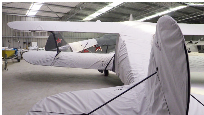
Beech Staggerwing Complete Cover Set

This cover type is made from Silver Acrylic Sunbrella canvas and is 100% lined with a soft and smooth microfiber. Bruce's Custom Covers developed this material combination especially for aircraft protection. The outer material is medium weight and treated for water resistance, UV resistance and anti-static buildup. The inner lining is a very soft and smooth microfiber to prevent scratching. The material is very reflective, and tests show that the cabin interior temperature can be reduced to near-ambient temperature on the hottest of days. It is water, ice and snow repellent, yet breathable to allow moisture to escape from between the cover and the aircraft surface.