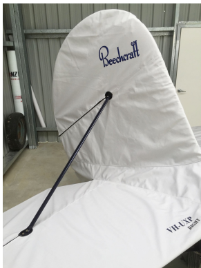
Beech Staggerwing Complete Cover Set, Tail Detail

WINTER USE MATERIAL - Made with Solution-Dyed Polyester fabric, this option is intended for seasonal use to aid in deicing, rain mitigation, or for occasional travel. The material is lighter and more compact, but more susceptible to UV damage and may have a shorter useful life if used continuously outside than the all-year use material.