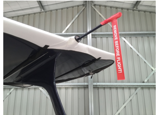
Beech Staggerwing Complete Cover Set, Upper Wing Detail