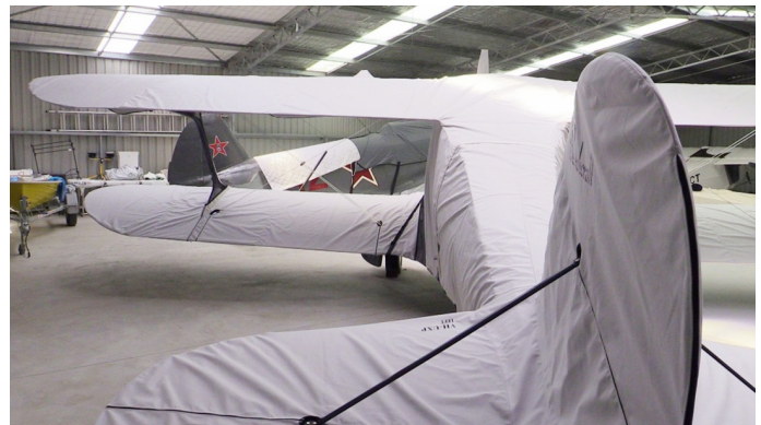
Beech Staggerwing Complete Cover Set