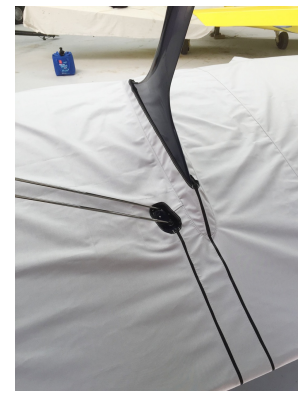
Beech Staggerwing Complete Cover Set, Lower Wing Detail