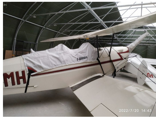
Stampe SV-4 Canopy Cover