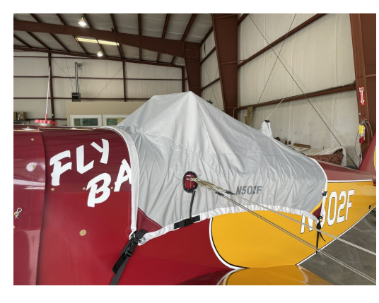
Bowers Fly Baby Canopy Cover