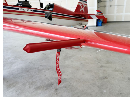
Sukhoi SU-26 Pitot Cover